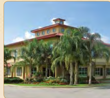
Lake Charles/Southwest Louisiana Convention & Visitors Bureau

1205 North Lakeshore Drive Lake Charles, LA 70601, USA