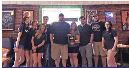
2ND - LUNA BAR & GRILL