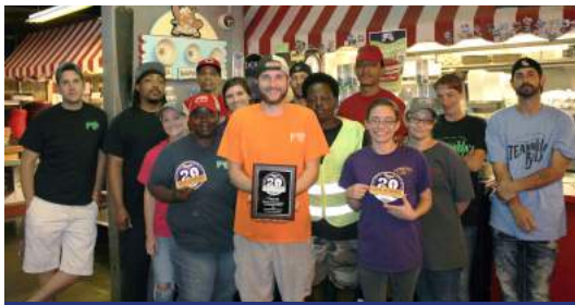
1ST - STEAMBOAT BILL’S