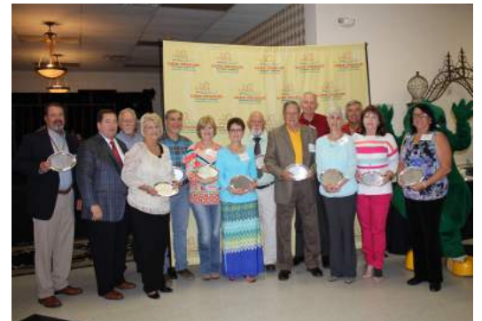
2017 VOLUNTEERS OF THE YEAR 2016 LHSAA Marsh Madness Team Hosts