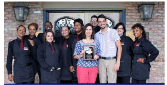
3RD - PAT’S OF HENDERSON

www.VisitLakeCharles.com #VisitLakeCharles