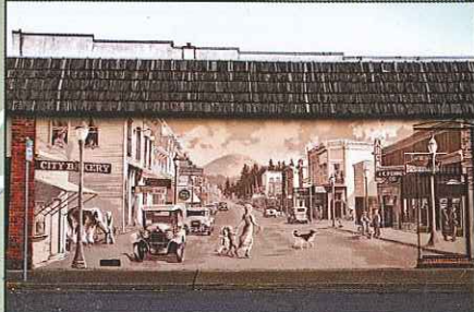
1920's Main Street Scene Mural - This 12' x 73' mural is on the west wall of 501 East Main Street, currently operating as Shoestrings. The mural is an authentic rendering of Main Street, Cottage Grove in the 1920's, as recorded in a photo from the period. Artist: Connie Huston. 2007

Murals 1 through 5 sponsored and funded by the Cottage Grove Mural Committee