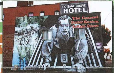
Buster Keaton Mural - This mural is painted on the east wall of the building adjacent to the old Cottage Grove Hotel, which is located at the intersection of Highway 99 and Main Street. The mural commemorates the motion picture, "The General," which was filmed near Cottage Grove in 1926. Artist: Howard Tharpe. 2002