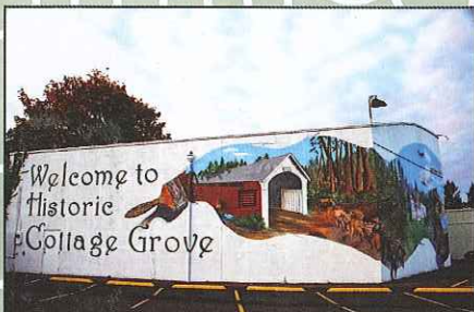
Welcome To Cottage Grove Mural - This mural is painted on the east and south walls of the Moose Lodge, located at 711 Highway 99S (Near the intersection of Highway 99 and Harrison Street). Artist: Suzi Marquess Long. 2004