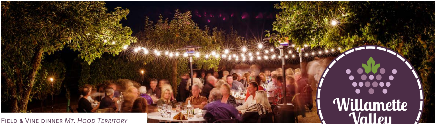
FIELD & VINE DINNER MT. HOOD TERRITORY