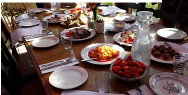
GATHERING TOGETHER FARM CORVALLIS, OREGON