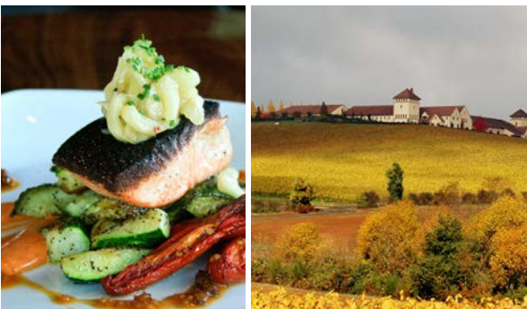
MAGENTA RESTAURANT CORVALLIS, OREGON KING ESTATE WINERY EUGENE, OREGON