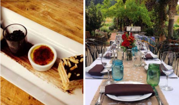
JOEL PALMER HOUSE DAYTON, OREGON VILLA CATALANA SHERWOOD, OREGON

To pioneers, the Willamette Valley was the fertile promised land at the end of the trail. Today, culinary dreamers are taking that legendary bounty and creating artisan food & drink you'll have to taste to believe.