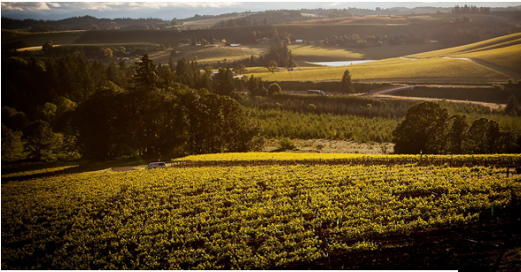
WILLAMETTE VALLEY VINEYARD SALEM, OREGON