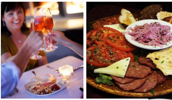
DUNDEE BISTRO DUNDEE, OREGON NOVAK'S HUNGARIAN ALBANY, OREGON