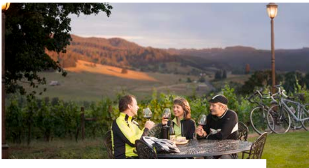
SWEET CHEEKS WINERY EUGENE, OREGON