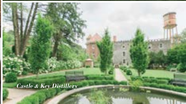
Castle & Key Distillery