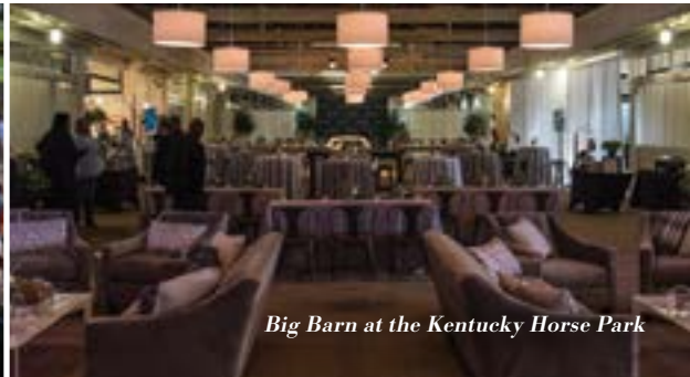
Big Barn at the Kentucky Horse Park