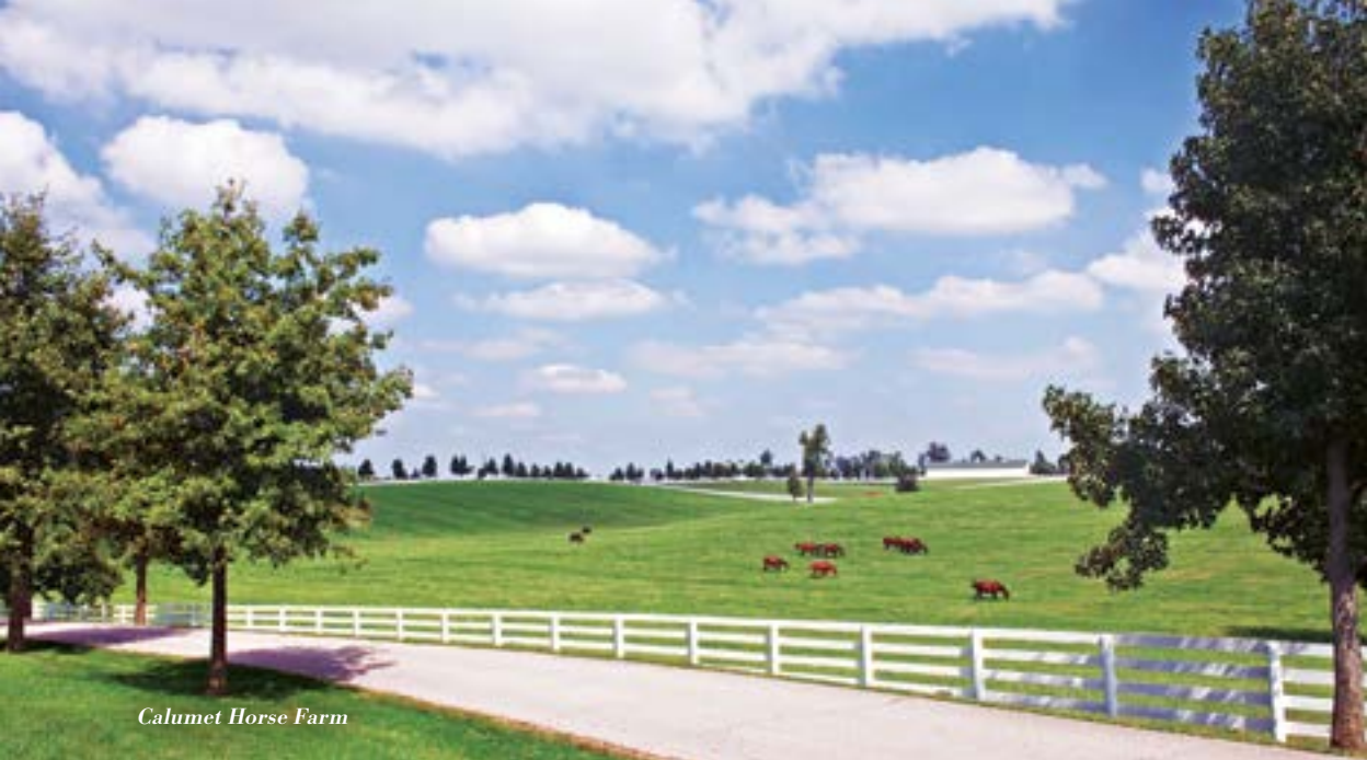
Calumet Horse Farm