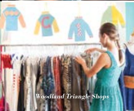
Woodland Triangle Shops