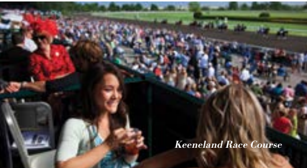
Keeneland Race Course

To market and promote Lexington's Bluegrass Region for the purpose of attracting visitors and growing the economy.