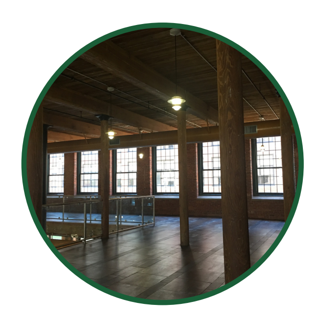
Atrium at Bates Mill May 10, 2018 4:30pm-6:30pm 36 Chestnut St Lewiston, Maine

We are pleased to announce that this year, all exhibitors will be recognized and have a chance to exhibit at both our 97th Annual Meeting Luncheon at the Agora Grand on May 11, 2018 as well as our Social Event at the Atrium at Bates Mill on May 10, 2018.