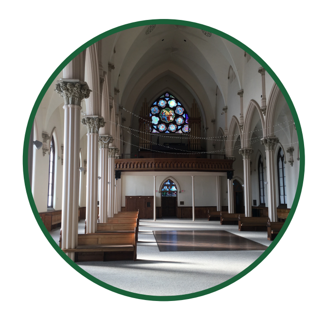
Agora Grand Event Center May 11, 2018 9am-2pm 220 Bates Street Lewiston, Maine