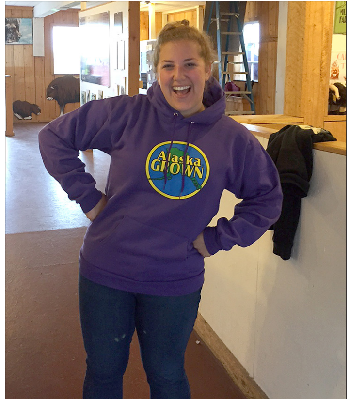
Instagram user adventurer_anonymous was one of the weekly winners of an Alaska Grown hoodie as part of the campaign.