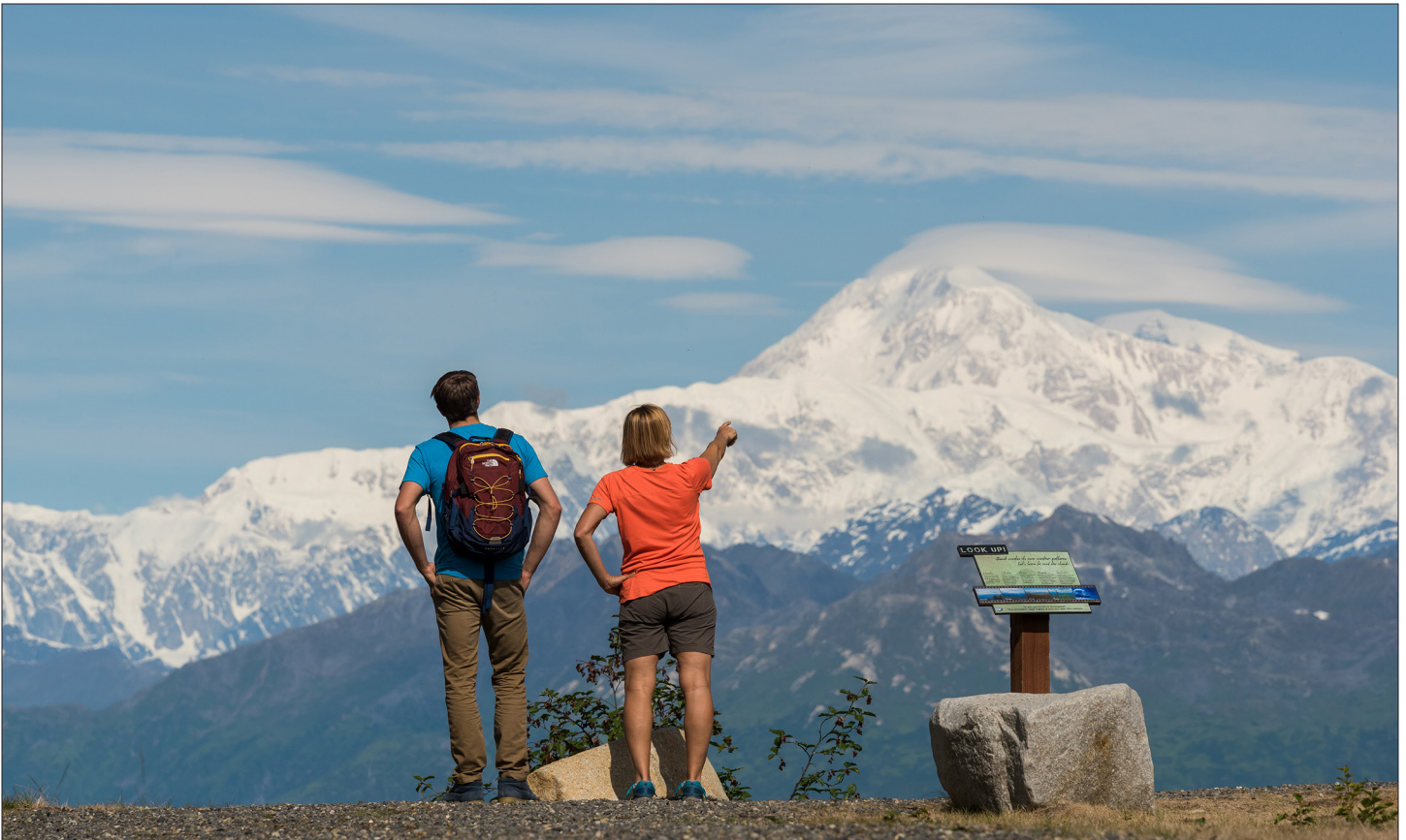
This view of Denali is part of the Moose Flats Trail at the new Kesugi Ken Campground in Denali State Park. For more about the campground, which opened this spring, please see the accompanying article on Page 7.