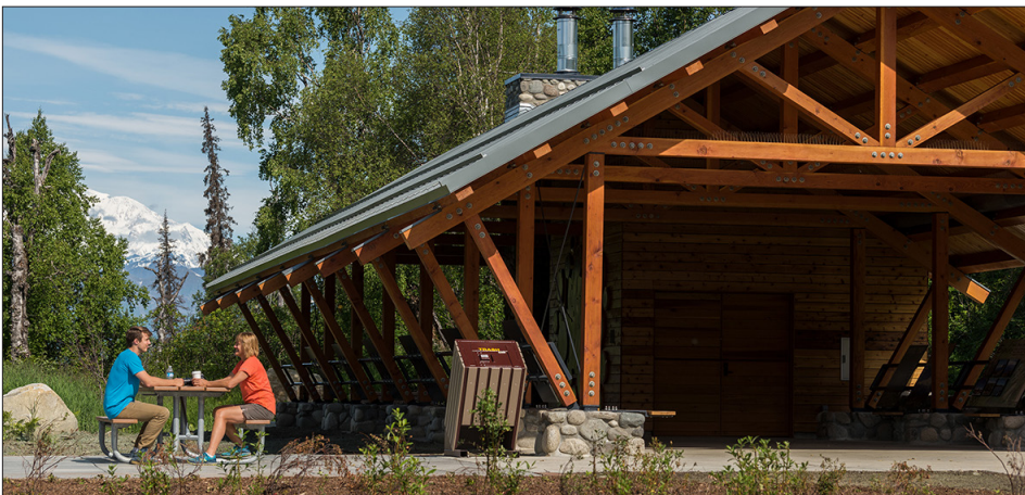
The new Kesugi Ken Campground features a world class interpretive center.