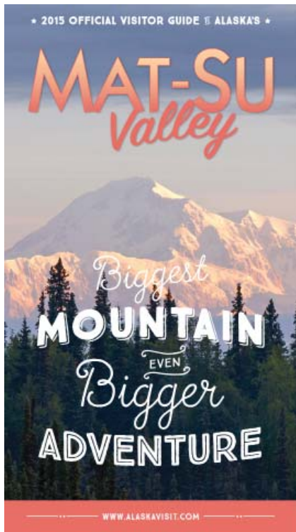
The 2015 Visitor Guide, above, is also available online for download for the first time, to better assist those who don't want a printed guide but still want the information.