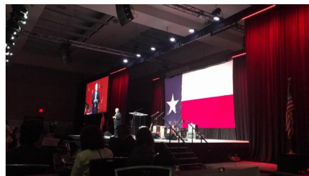
TTIA 2018 Unity Dinner

The VisitMidland team attended the 2018 Texas Travel Industry Association's Unity Dinner in Austin. The evening focused on the impact of Hurricane Harvey to the tourism industry and the importance of receiving full funding for Texas Tourism during the next legislative session.