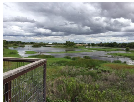
I-20 Wildlife Preserve & Jenna Welch Nature Study Center Playa

The I-20 Wildlife Preserve & Jenna Welch Nature Study Center is a hidden gem tucked between Interstate 20 and an oil-field pipe yard. The 99-acre preserve is centered on a 30-acre urban playa wetland. The site contains a 3.4 mile trail system with a 1.45 mile ADA-accessible trail loop. Once inside, you will find a 24 foot hawk observation tower, 4 teaching platforms, 2 butterfly gardens, 4 feeding stations, a 2,105 foot boardwalk, and 7 bird blinds.