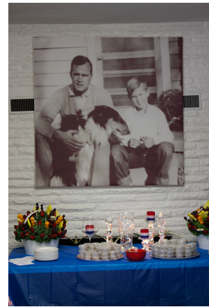
GWB Childhood Home