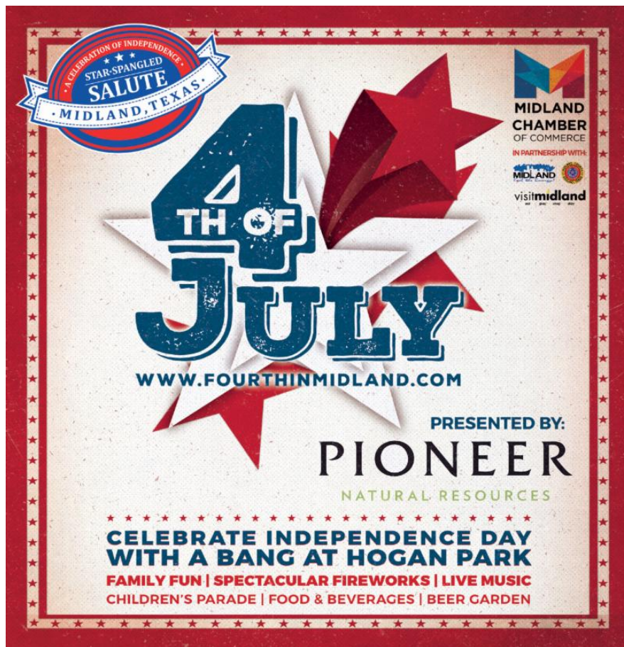
Star Spangled Salute