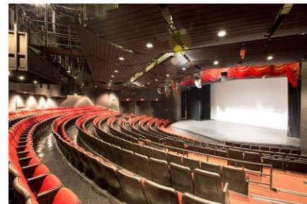
MCT Cole Theatre