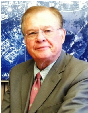
Charles Hayes Monterey Regional Airport