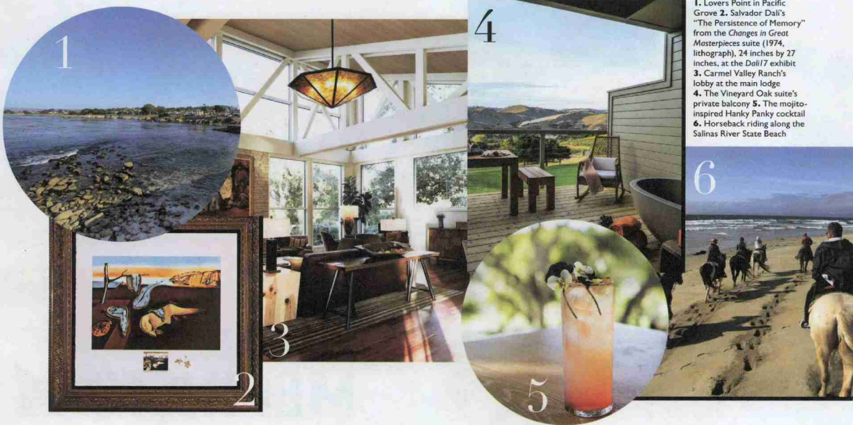
1. Lovers Point in Pacific Grove 2. Salvador Dalí's "The Persistence of Memory" from the Changes in Great Masterpieces suite (1974, lithograph), 24 inches by 27 inches, at the Dali17 exhibit 3. Carmel Valley Ranch's lobby at the main lodge 4. The Vineyard Oak suite's private balcony 5. The mojito-inspired Hanky Panky cocktail 6. Horseback riding along the Salinas River State Beach

It's the mother of all backdrops for HBO's Big Little Lies , the landscape of many a Steinbeck story, a surrealist setting for artist Salvador Dalí and, now, the environs for your next escape. Yes, Monterey County, Calif. , lends itself to the creative eye, but it's also a sanctuary for travelers on a quest to enrich their minds and bodies. Follow our three-day route—your journey starts now. — Kristen Schott