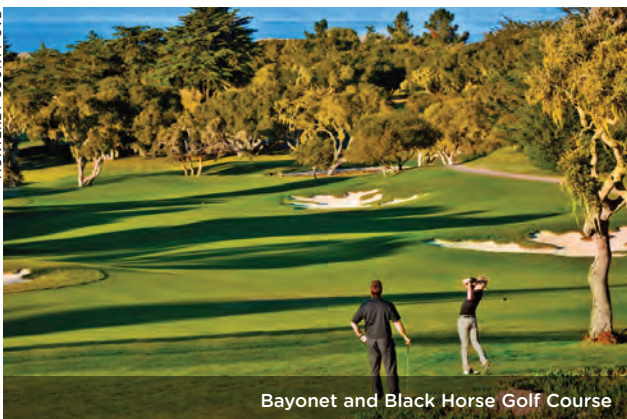
Bayonet and Black Horse Golf Course