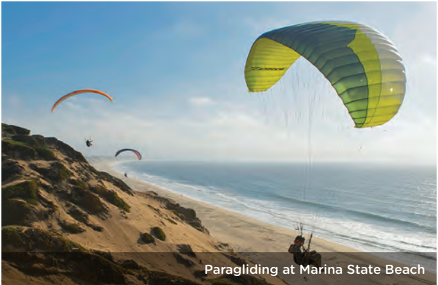
Paragliding at Marina State Beach