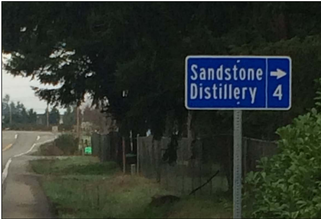
Example Sign Installation