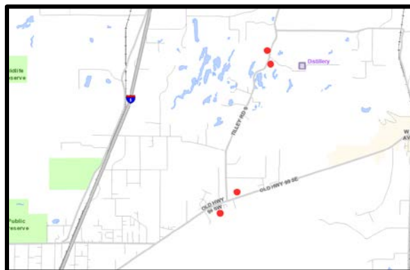
Motorist Information Sign Map