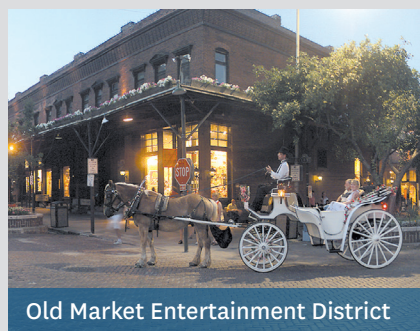
Old Market Entertainment District