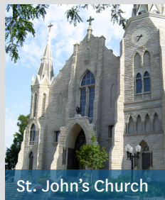
St. John's Church