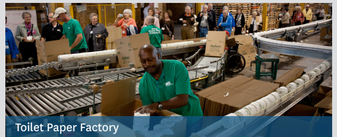
Toilet Paper Factory