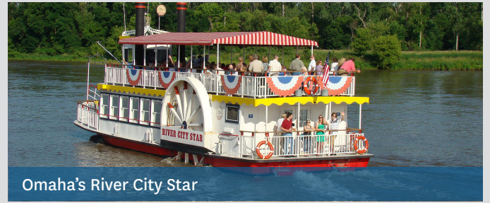
Omaha's River City Star