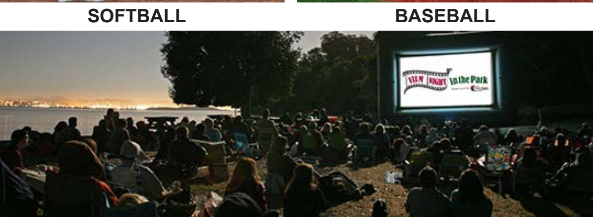
FAMILY MOVIE NIGHT