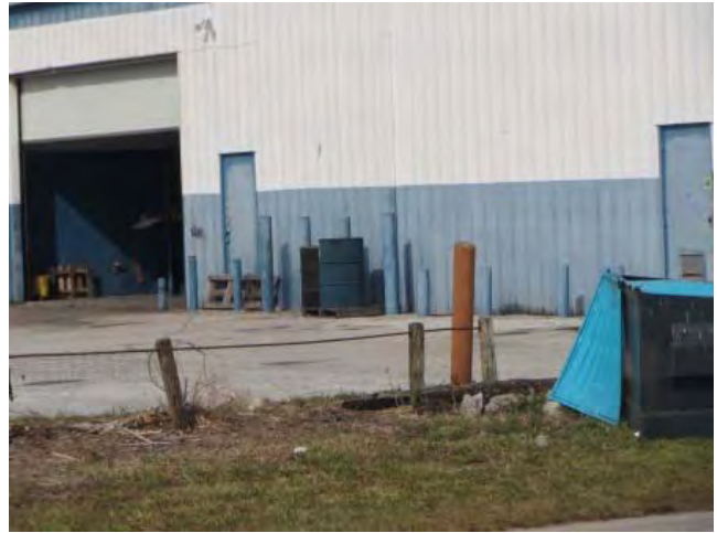
View of 55-gallon drums stored outside 325 Transmission.