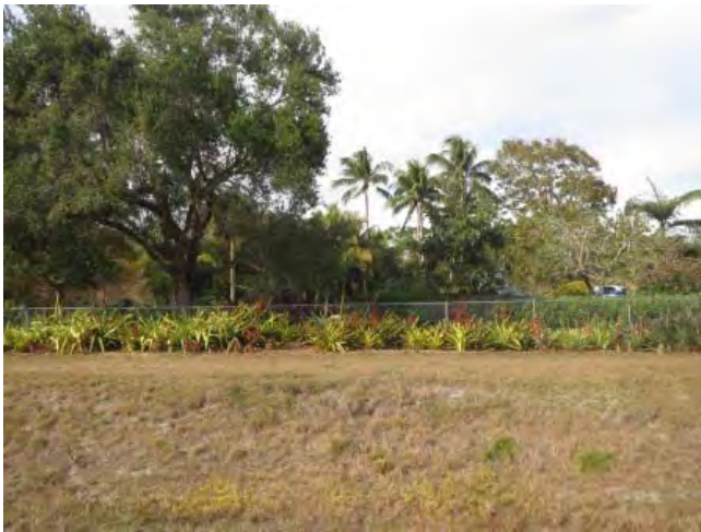
NE corner facing north at the adjacent botanical gardens.