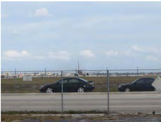
View looking across North Military Trail at PBIA.