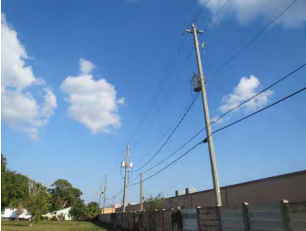
View of pole-mounted transformers along the southern border of the Site.