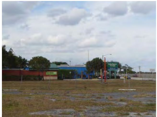
View of the automotive and self storage businesses adjacent on the northeast corner of the Site.