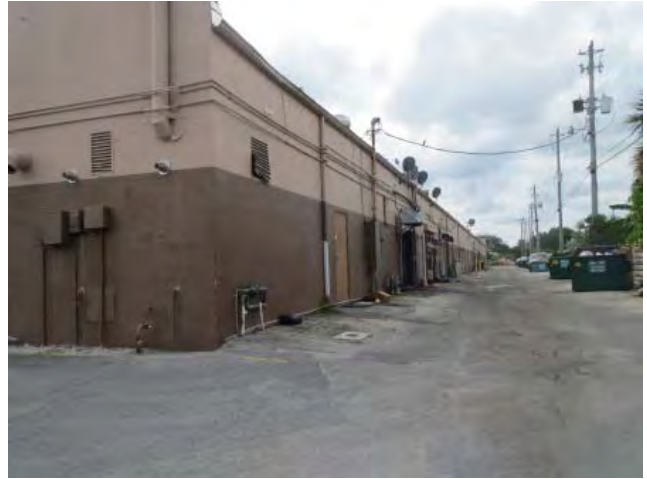
View of the backside of the SW adjoining shopping center.