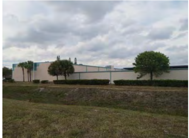
View of the self storage facility bordering the Site on the northwest corner.