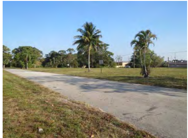
View looking east down Wallis Road.