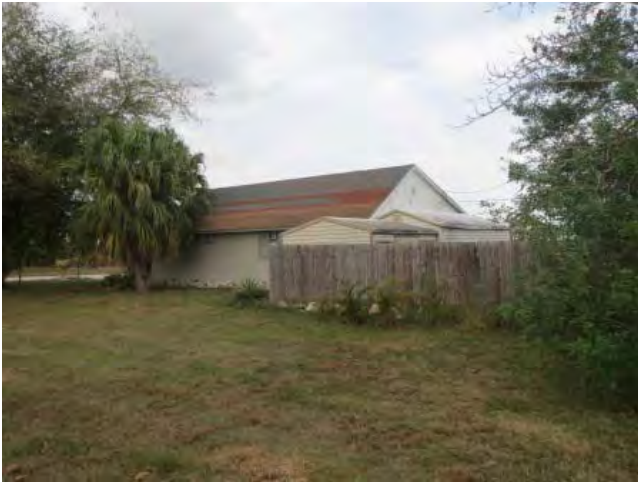
View of one of the single-family houses surrounded by the Site.