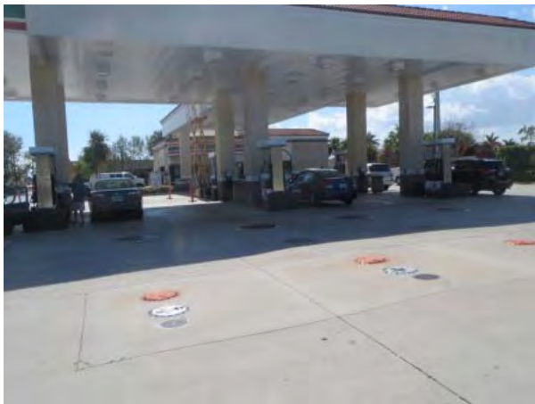
Northern adjacent Sunoco UST