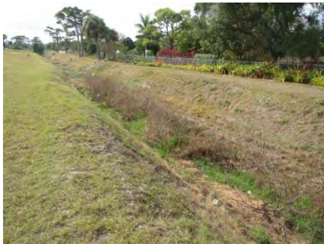
View of the northern adjoining drainage canal along the eastern side of the Site.