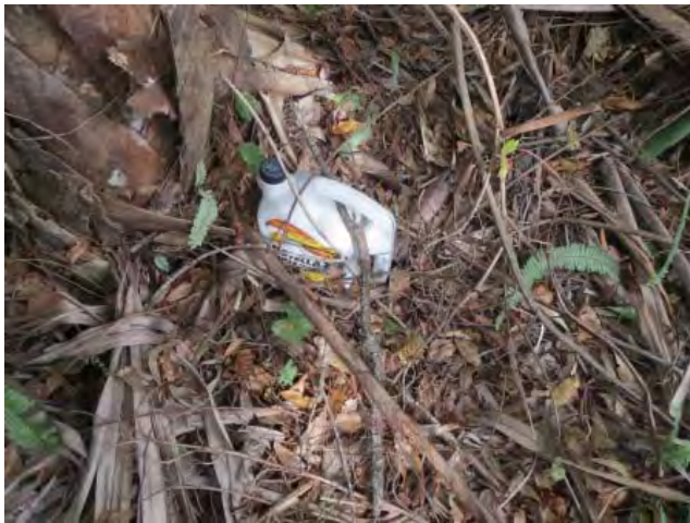
View of a discarded oil can with product located in the wooded area.