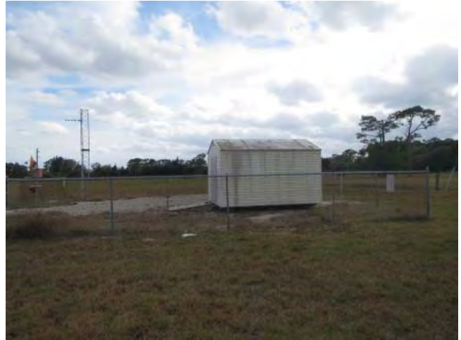
View of the small onsite structure part of PBIA and operated by the TSA.