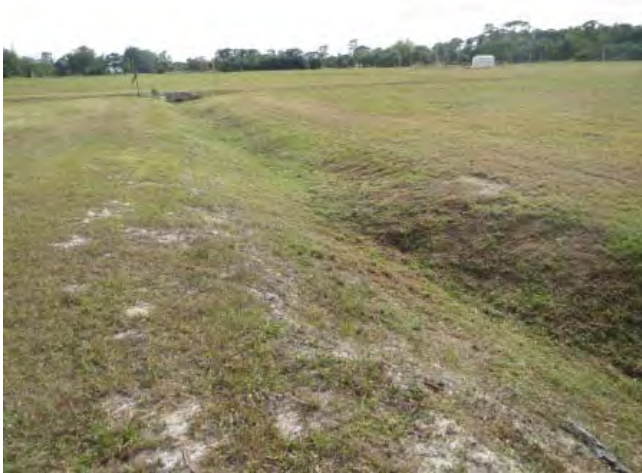
View of the drainage canal transecting the Site from north to south.