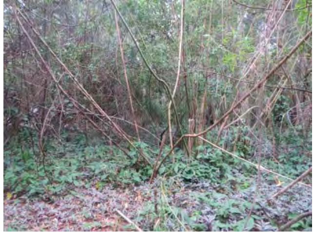
View within the heavily wooded area on the western portion of the Site.