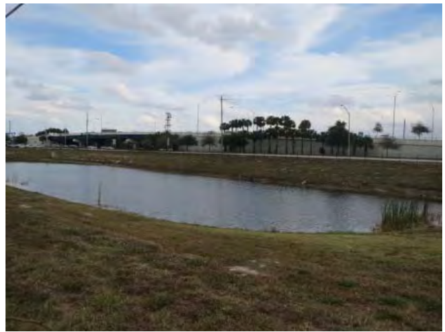
View of one of the southern adjoining stormwater management ponds.