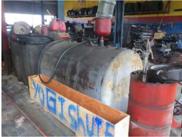
View of 500-gallon AST within the Auto Care of the Palm Beaches building.