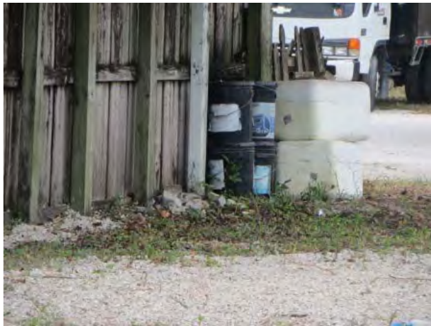
View of hydraulic oil and motor oil stored onsite outside one of the adjoining residences.