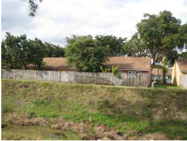
View of the multi-family housing adjacent to the north along the northwestern portion of the Site.