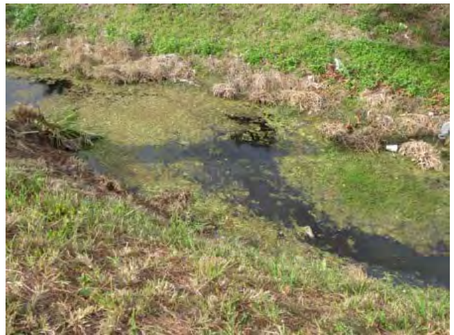
View of the northern adjoining drainage canal along the western side of the Site.