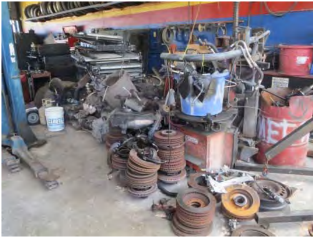
View of metal scrapes within the garage at Auto Care of the Palm Beaches.