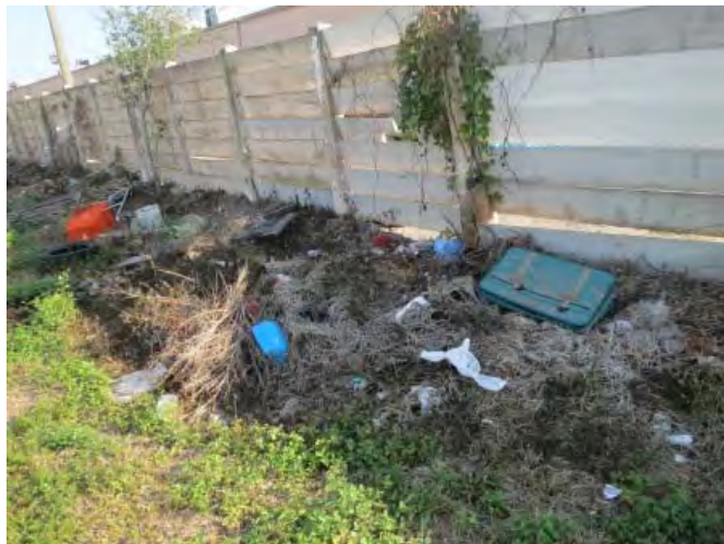
View of debris and dumped items along the SW border of the Site adjoining to the Dollar General shopping center.