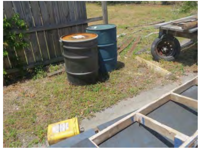
55-gallon drums behind AA Transmission.