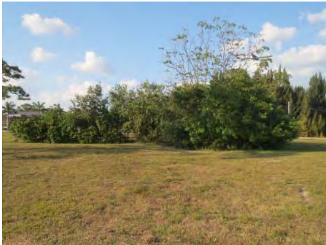
View of some of the small wooded patches at the Site.