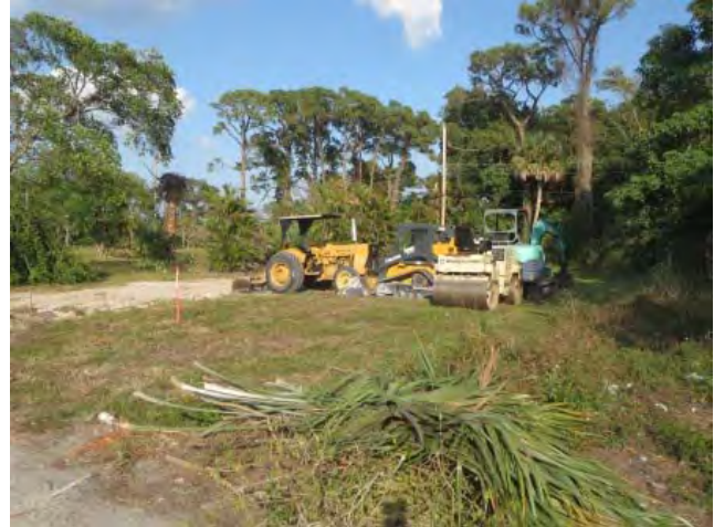
View of construction equipment stored on the southern portion of the Site