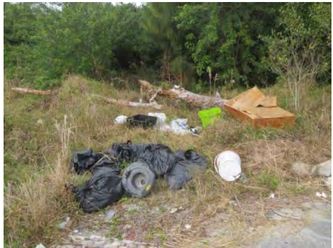
View of dumped items along Wallis Road.