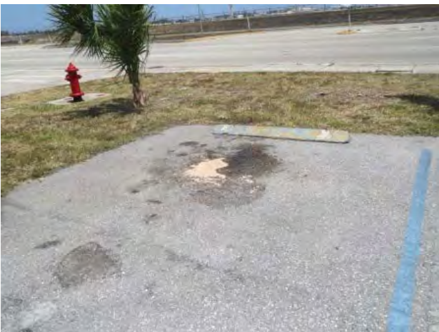
Sorbent on the northwest corner of the Auto Care of the Palm Beaches parking lot.