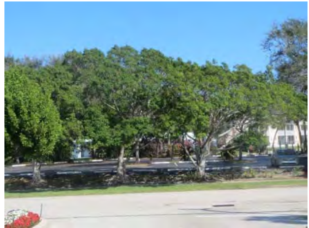
Northern adjacent church.