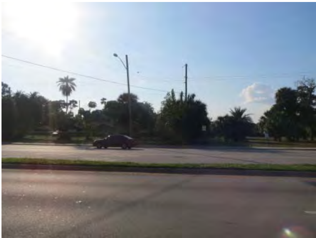
View looking across Haverhill Road to the west.