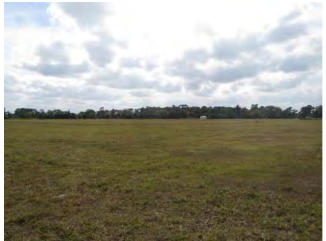
View facing southwest looking across the Site from the NE corner.