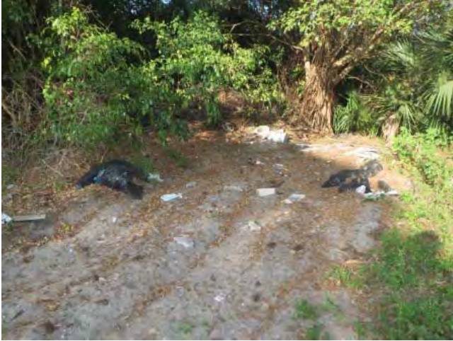
View of some dumped items located at the Site.