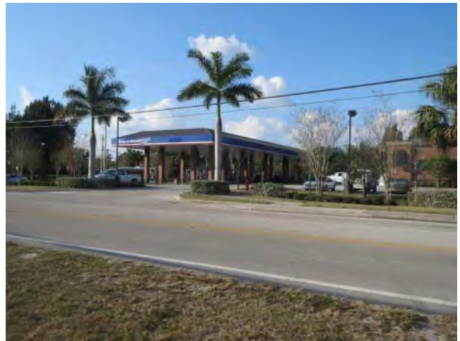
View of the RaceTrack gasoline station surrounded by the Site.