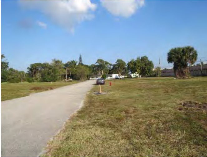
View of the southwest portion of the Site.