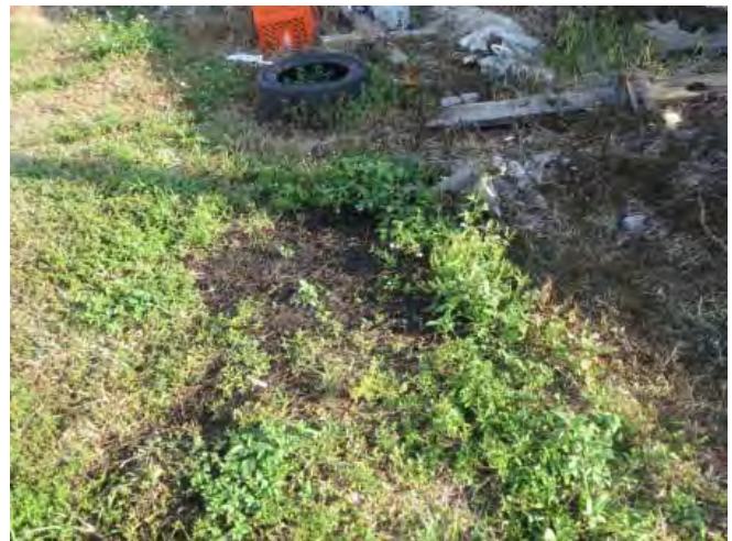
View of stained soil and stressed vegetation on the SW portion of the Site.