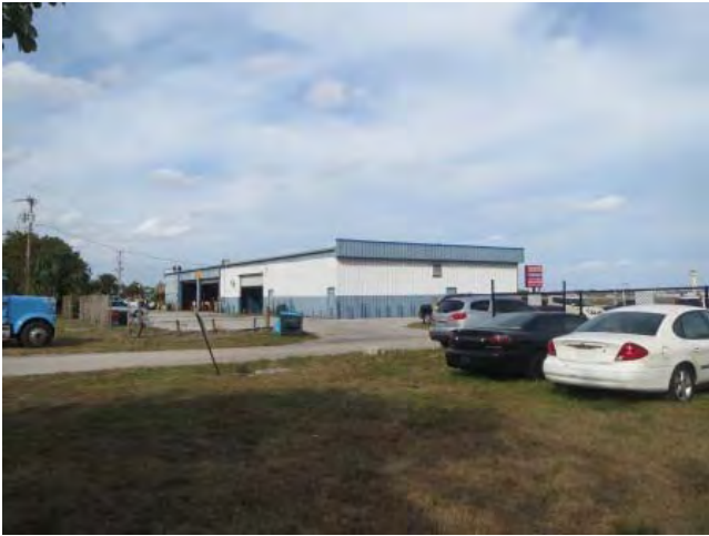
View of 325 Transmission bordering the Site to the east.