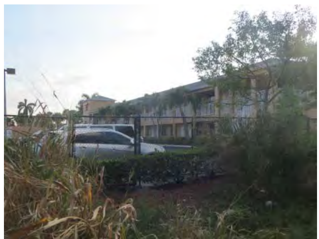
View of the southern adjoining Motel.