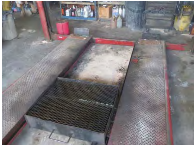
Sorbent present under one of the hydraulic lifts at the Auto Care of the Palm Beaches building.