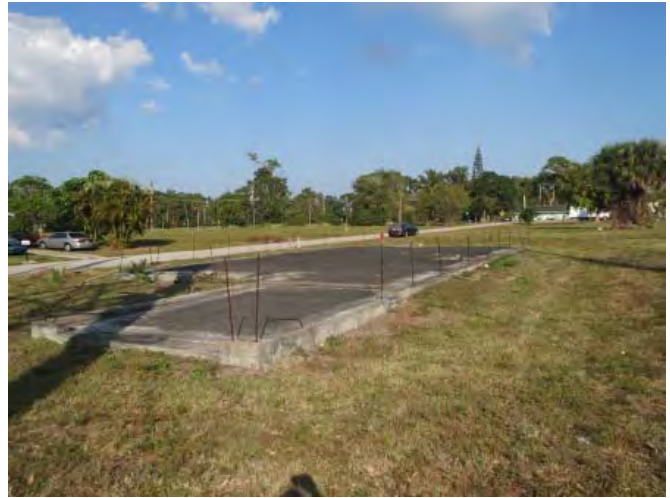
View of foundations for former single-family residences on the SW portion of the Site.