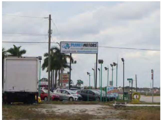
View of Planet Motors automotive sales bordering the Site to the east.