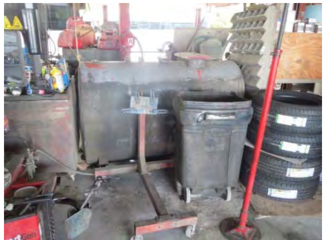
View of the 275-gallon AST within the Auto Care of the Palm Beaches building.