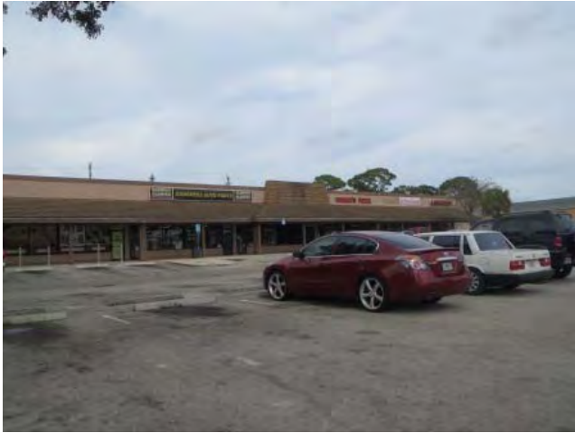
View of the southern adjoining shopping center housing the Dollar General and formerly housing Admiral Cleaners.