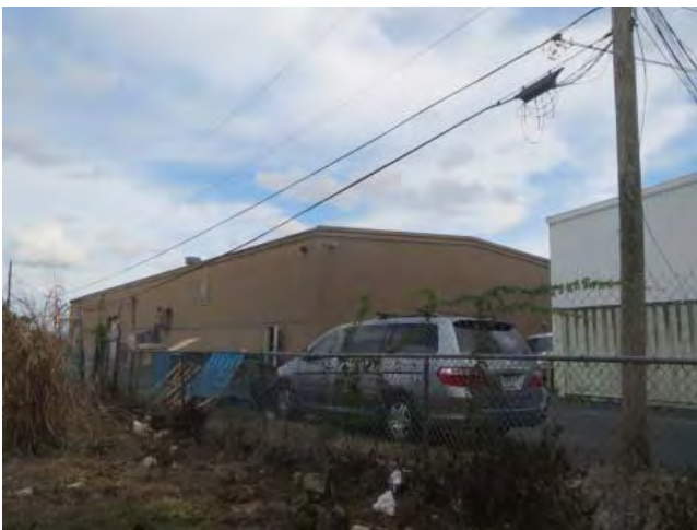
View of the southern adjoining J&J Electric.