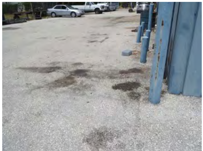
The asphalt driveway behind AA Transmission and Auto Care of the Palm Beaches.