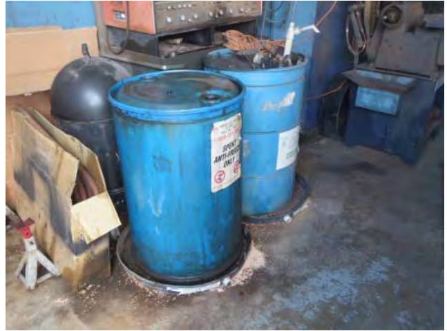
View of used coolant drums within the Auto Care of the Palm Beaches building.