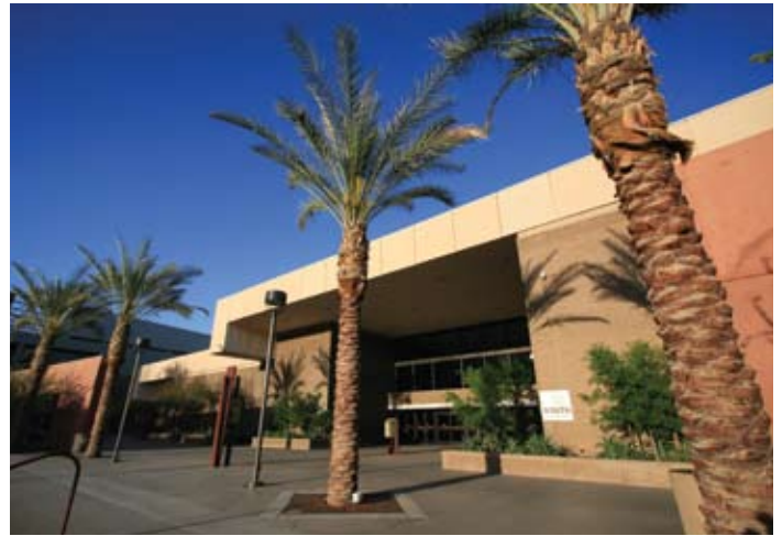
New and welcoming entrance

The overall concept of the landscape design, selection of indigenous, low water use plant materials and density of landscaping is consistent with the North and West Buildings, presenting seamless transition from one venue to the other.