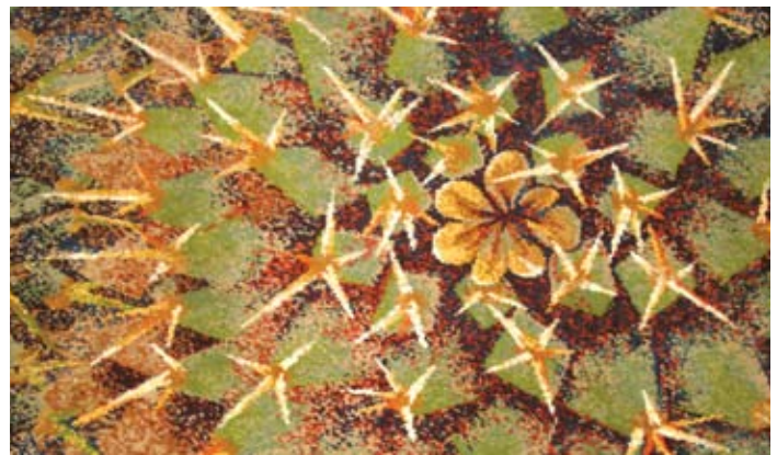
Indigenous carpet pattern