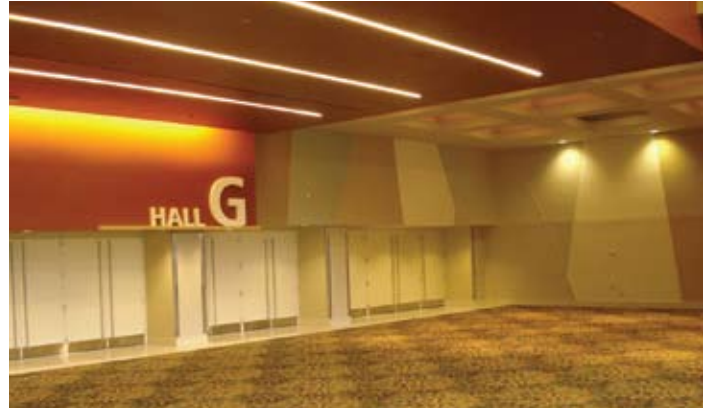
Meeting Room and South Lobby

Behind the scenes the South Building incorporates new equipment, audio, building automation and security systems, as well as an upgraded data network with WiFi coverage in selected areas for the ease and convenience of clients and guests.