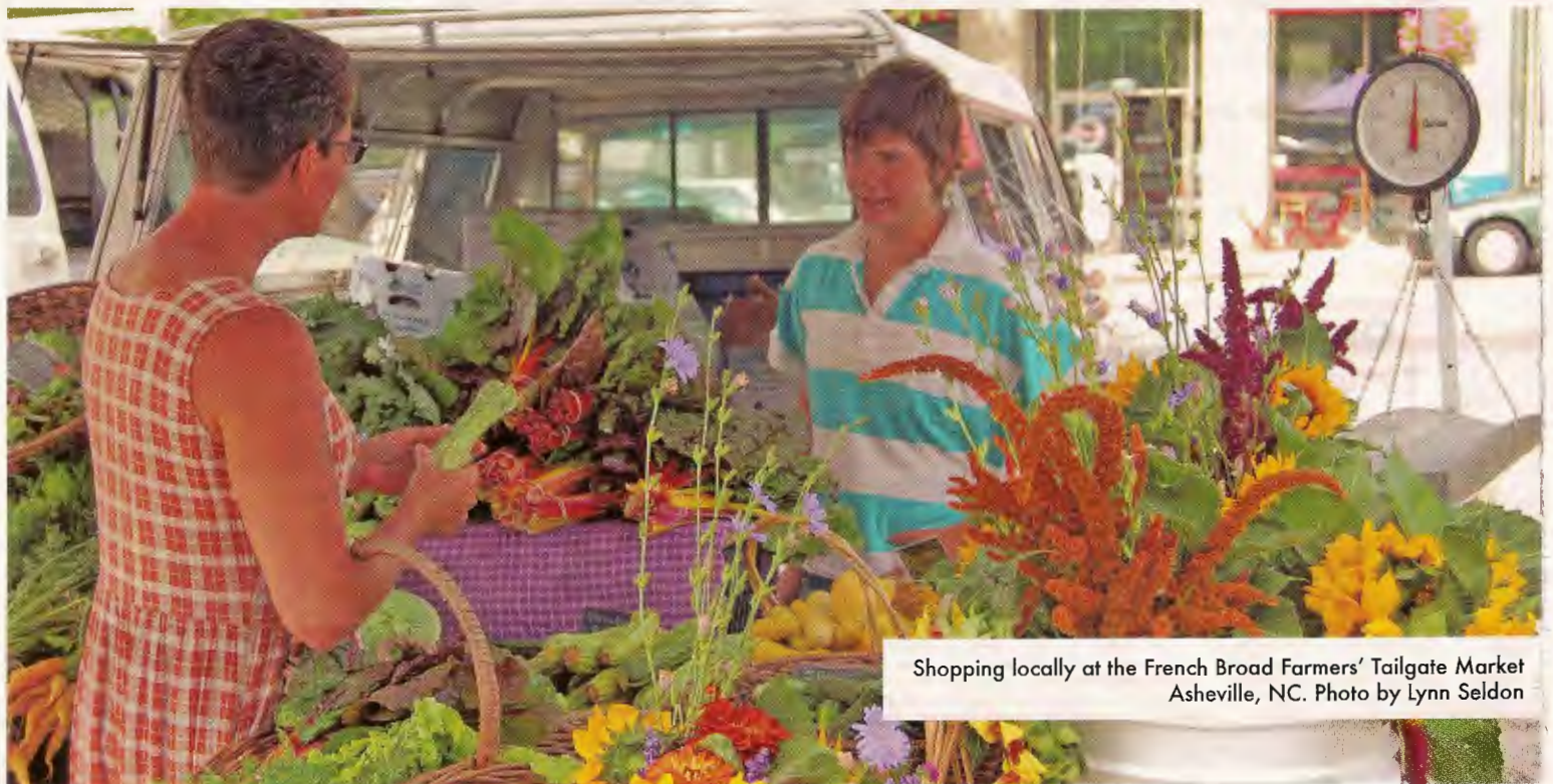
Shopping locally at the French Broad Farmers' Tailgate Market Asheville, NC.

Though there are hundreds of farmers' markets across the country on any given day, here is a selection of top farmers' markets from Portland, Maine, to Portland, Oregon.