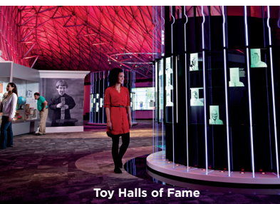
Toy Halls of Fame