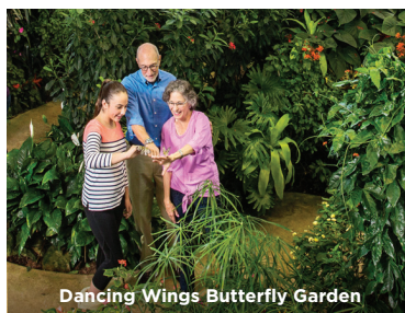
Dancing Wings Butterfly Garden