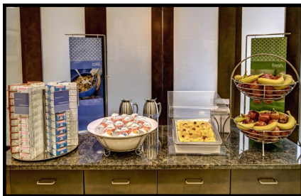
Complimentary Hot Breakfast Buffet