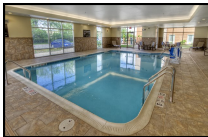
Heated Indoor Pool