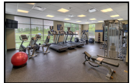
Full Fitness Center