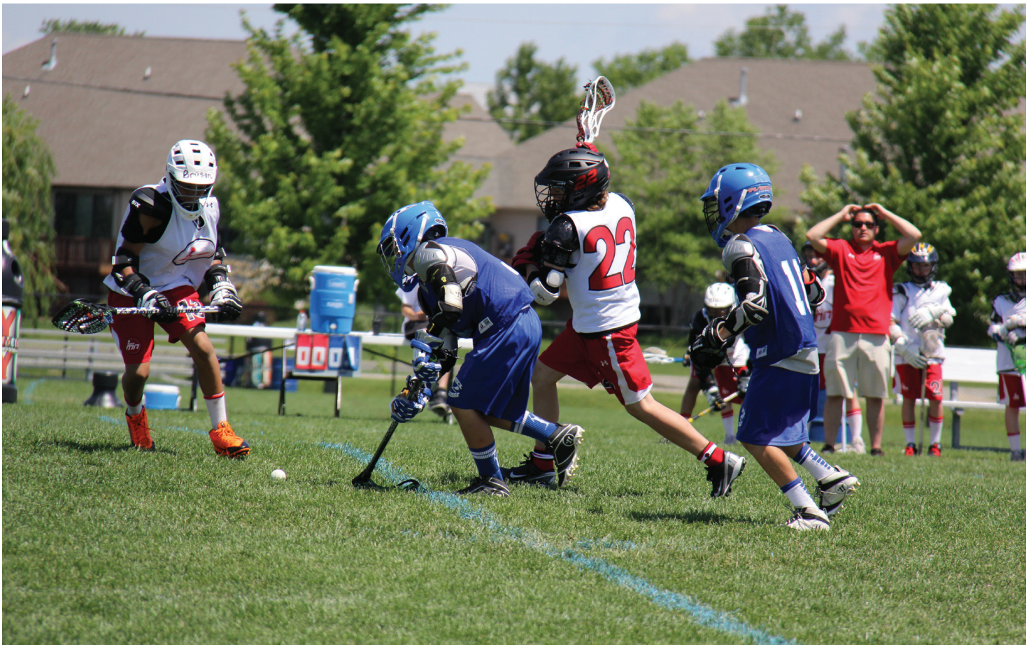
NXT Sports has produced premier lacrosse tournaments in the region since 2013, when it launched the inaugural Rock River Cup.