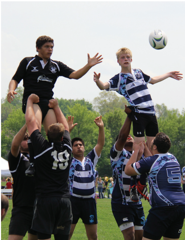
Rugby Illinois' High School and Middle School State Championships at Mercyhealth Sportscore Two.