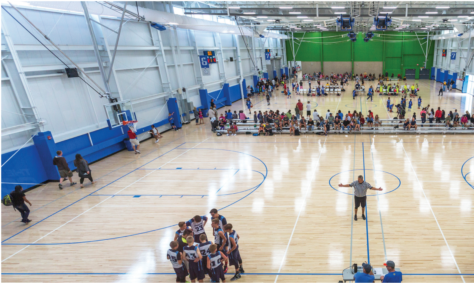
UW Health Sports Factory in Rockford, Illinois