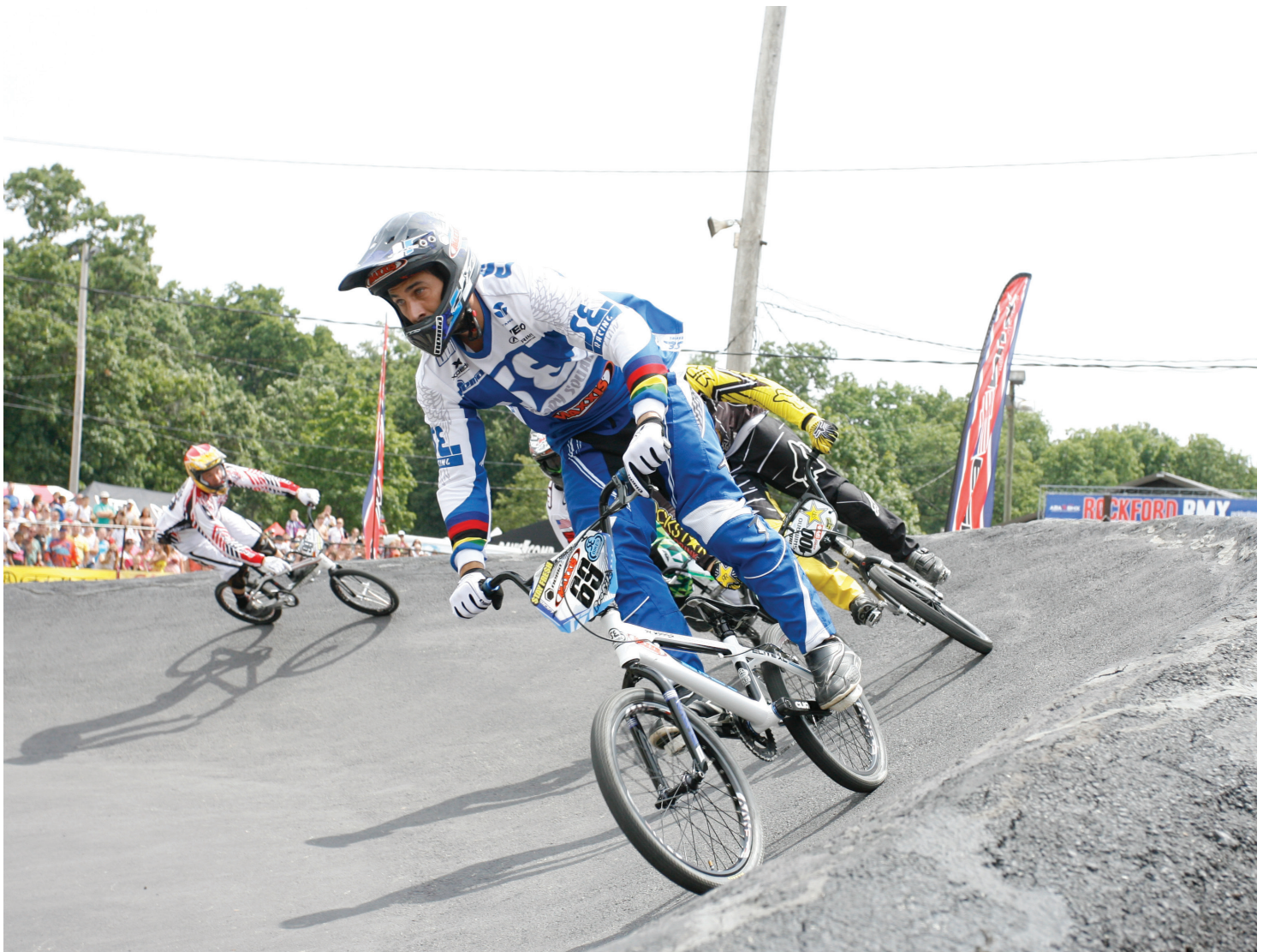
Rockford BMX has hosted the USABMX Midwest Nationals for more than 30 years.

Relationship building is at the apex of what event owners prioritize and it refers to one of the most difficult challenges when entering a market: the method of access. Park district