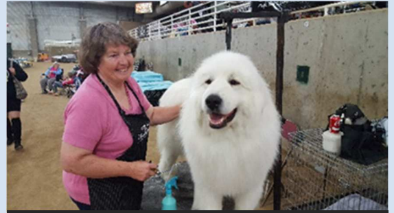
A sheepdog is prepped for the competition.

The Intermountain Kennel Club hosted the Beehive Cluster show May 4 - 7. The show included spaniels, bulldogs, Shetland sheepdogs, Doberman Pinschers and collies.