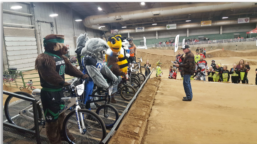
Mascots from Various Sports Teams Show Off Their BMX Racing Skills.

The Equestrian Park is not just about horses. The diversity of events continues to grow as other sport organizations look to the Park as a venue. Plus, the Park offers great spaces for concerts, tradeshow or meetings. Non-equestrian events included: Rad Canyon BMX racing, Jordan World Circus, Animal Assisted Healing Center, Carvention III and the Gathering of Tribes Lacrosse Tournament.