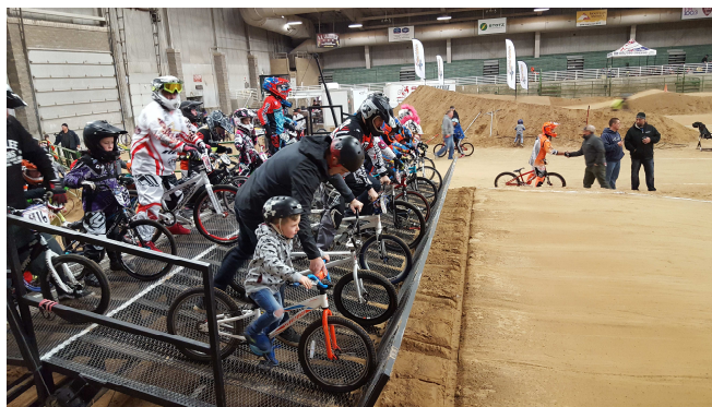
Riders Young and Old Love the Thrill of Competition