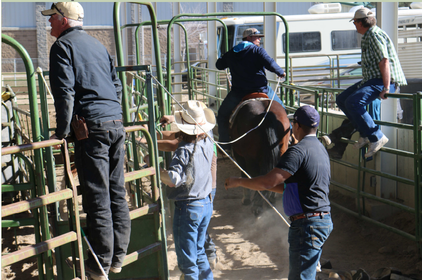
A roper finishes his ride as the gatekeepers prep for the next team.

The team roping competition was just one of many equestrian-related events held at the facility during first quarter. Others included: ZD Roping (x2), Barrel Buddies Winter Club Nights (x2), Utah Barrel Racing Association Jackpot (x4) and Utah Chariot Association Racing . From the Hearth Performance Horses held two events during the quarter and Alta Hills Farm booked the facility for five days in March. The USWRCA District 1 held a meeting, as well. The Salty Dash Futurity was a mid-March event that featured some of the best barrel racing horses in the state. (See Events , page 2)