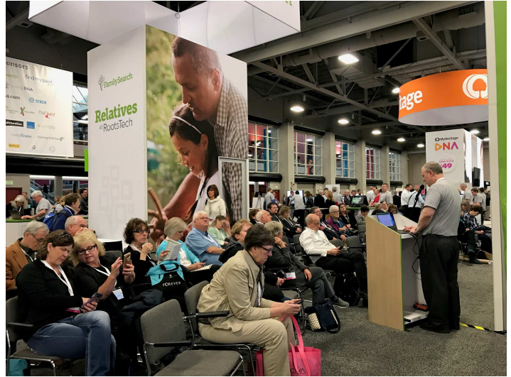
RootsTech Genealogical Conference Draws More Each Year.