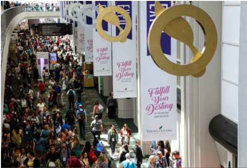
Young Living Essential Oils' attendees fill the concourse on their way to exhibits and sessions