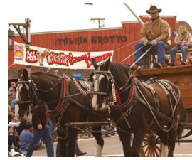
*PARADA DEL SOL PARADE February