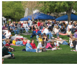
*SUNDAY A'FAIR January – April