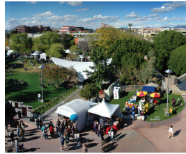
SCOTTSDALE ARTS FESTIVAL March