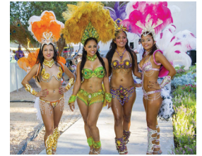
BRAZILIAN DAY FESTIVAL September