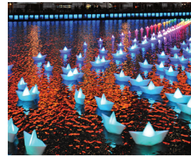
*CANAL CONVERGENCE November