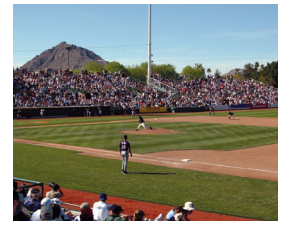
SPRING TRAINING March