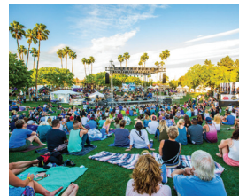
SCOTTSDALE CULINARY FESTIVAL April