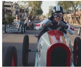
*GRAND PRIX OF SCOTTSDALE November