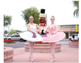
*SCOTTSDAZZLE November – December