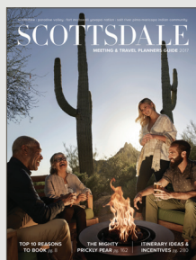
Meeting & Travel Planners Guide