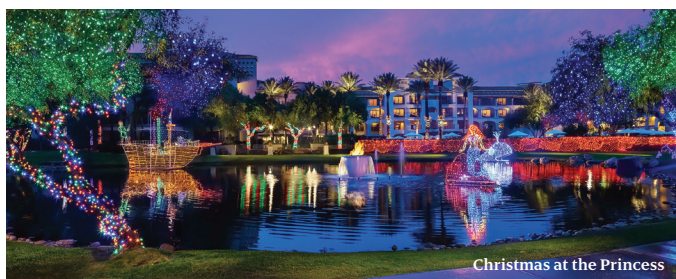
Christmas at the Princess

Every holiday season, the trails of the Desert Botanical Garden glow with the light of more than 8,000 hand-lit luminarias and thousands of twinkling white lights. Musical groups along the paths provide live entertainment ranging from Native American flute to traditional holiday carols.