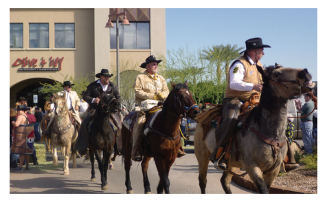
HASHKNIFE PONY EXPRESS January