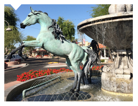
For more information visit ScottsdalePublicArt.org

Ready for more fabulous art? Download a copy of downtown Scottsdale's Public Art Walking Tour at ExperienceScottsdale.com and get ready to discover 10 of the city's most celebrated public art works. This self-guided tour will take you from the Scottsdale Waterfront through the Arts District and on to Old Town with plenty of to see and do along the way. You can take the entire tour in about 60 minutes, but we recommend allowing time for gallery browsing, shopping and a great meal at one of downtown's popular restaurants.