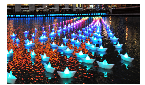
CANAL CONVERGENCE February