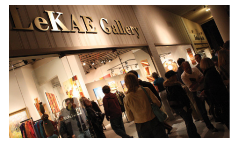
ARTWALK Thursdays year-round

There's always something exciting happening in downtown! From ArtWalks and the Farmers' Market to exciting cultural celebrations, here's a quick look at some of the special events you'll find in downtown throughout the year. For an up-to-theminute calendar of Scottsdale special events, visit ExperienceScottsdale.com.