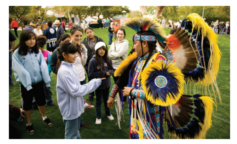
NATIVE TRAILS Janurary - March