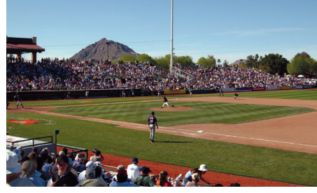
SPRING TRAINING March