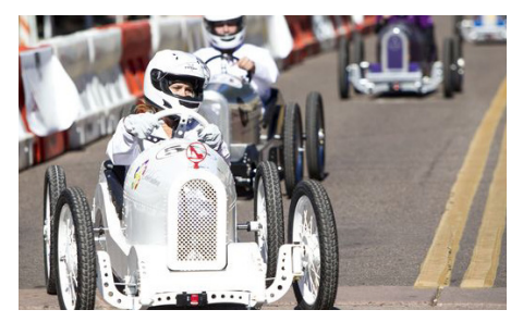
GRAND PRIX OF SCOTTSDALE November