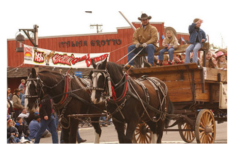
PARADA DEL SOL PARADE February