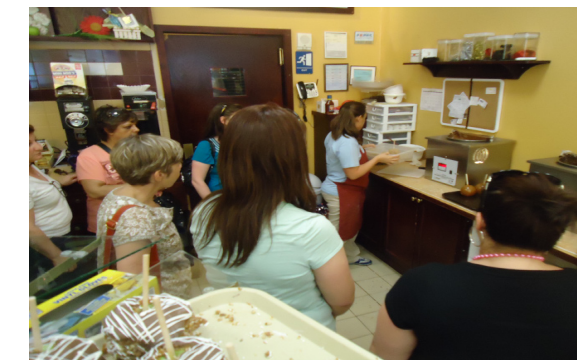
Canadian group tour operators and meeting planners were treated to a chocolate demonstration at the Chocolate Crocodile at the Louisiana Boardwalk. This was their first time visiting Shreveport-Bossier.