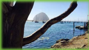
Morro Bay featured in Travel Pulse (left) and Hearst Castle featured in About Time Magazine (right).