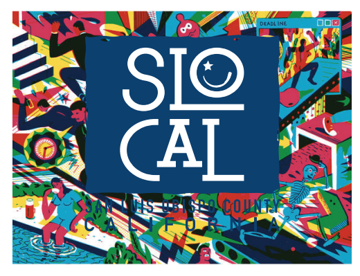
Logo Against Busy Background

It is recommended that the brand ambassador try to avoid these scenarios, or any scenarios not mentioned here, that can be seen as tampering with the brand, alternate brand or advertising logo's visual effectiveness, thus diminishing the brand's voice and message.