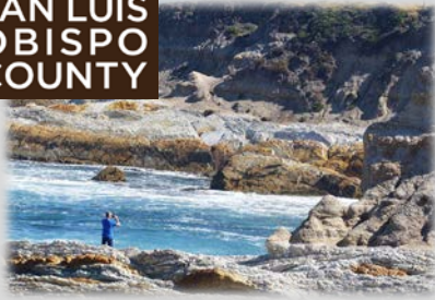
Featured in LA Times : Montaña de Oro State Park (left); and in Lonely Planet : Atascadero City Hall (right).

Visit San Luis Obispo County is a 501c6 tourism non-profit. For more information please call (805)541-8000.