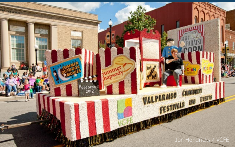
Jon Hendricks © VCFE