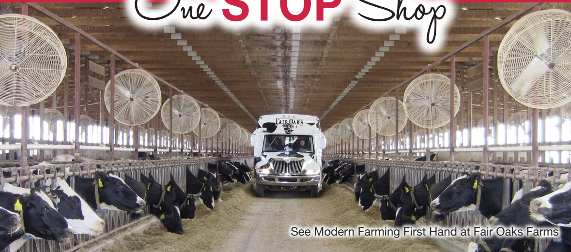
See Modern Farming First Hand at Fair Oaks Farms