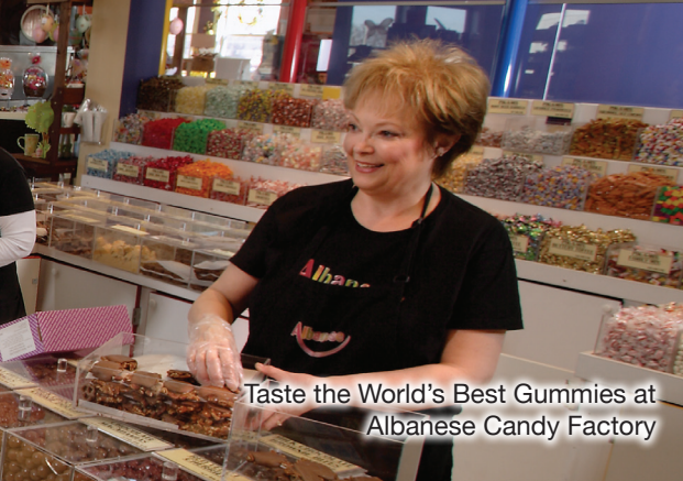
Taste the World's Best Gummies at Albanese Candy Factory