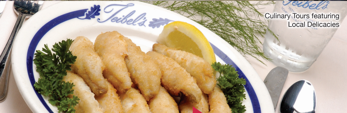
Culinary Tours featuring Local Delicacies