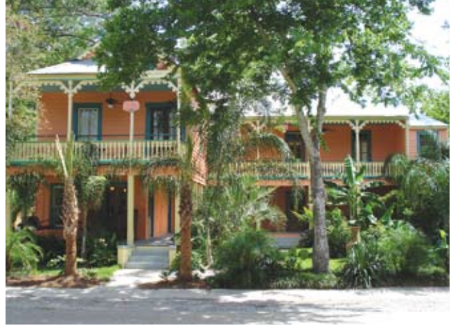
Mar Villa, Mandeville