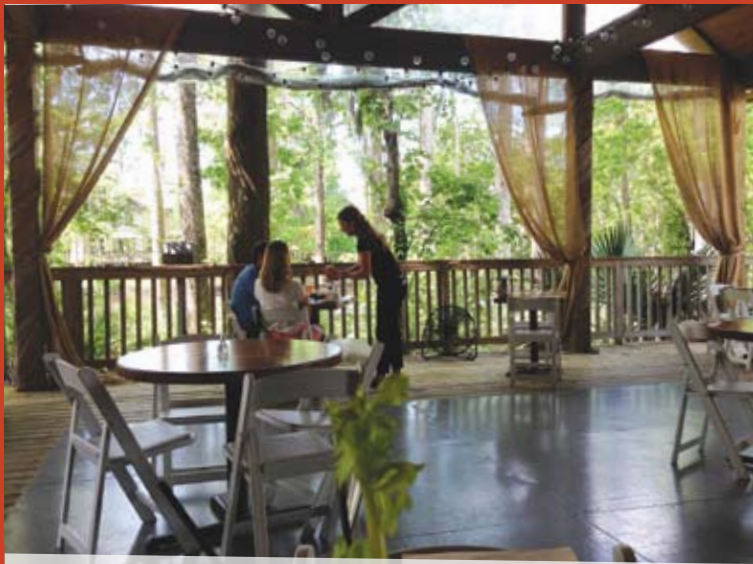
Great Louisiana seafood and a gorgeous bayou view star at Slidell's Palmettos.