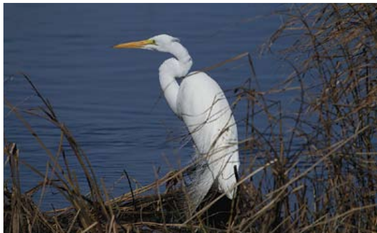
The Northlake Nature Center will host the Great Louisiana Bird Fest April 7-9.

Historic Dew Drop Concert 430 Lamarque St., Mandeville www.dewdropjazzhall.com Hours: 5-9pm