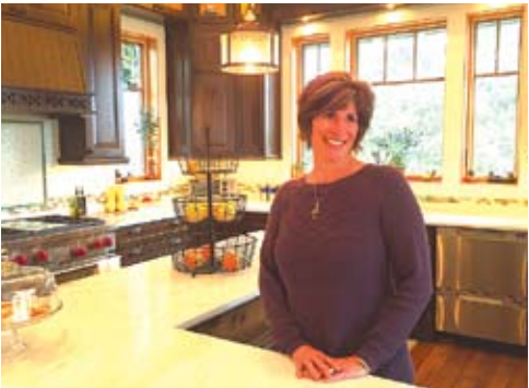
De la Bleau, Mandeville