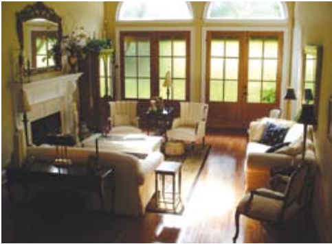
Maison Reve Farm, Folsom

PRSRST STD U.S. POSTAGE PAID PERMIT #253 MANDEVILLE, LA