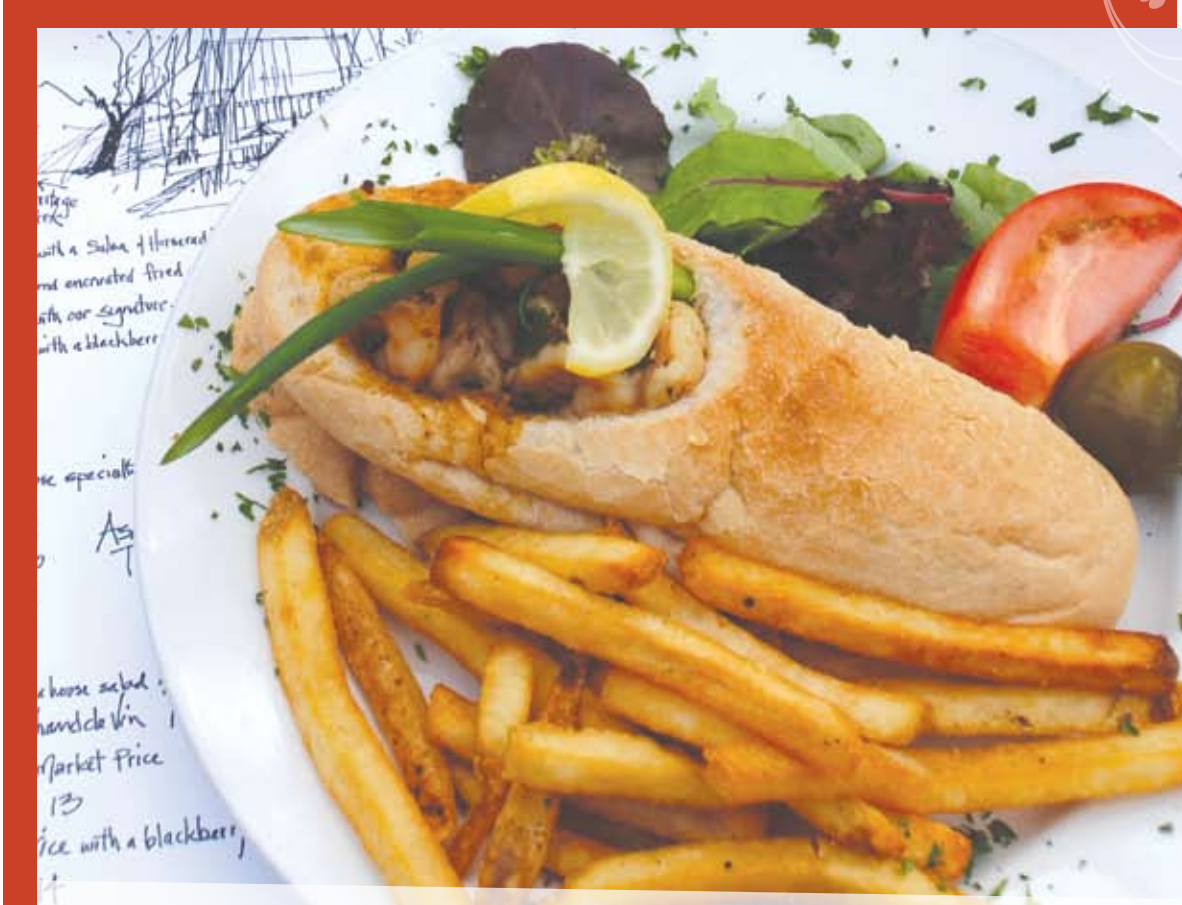
Palmettos combines two of south Louisiana's favorites — barbecued shrimp and the po-boy — in its popular sandwich.

Besh likes it here. The talented, Northshore-born celebrity chef is just one reason you will, too.