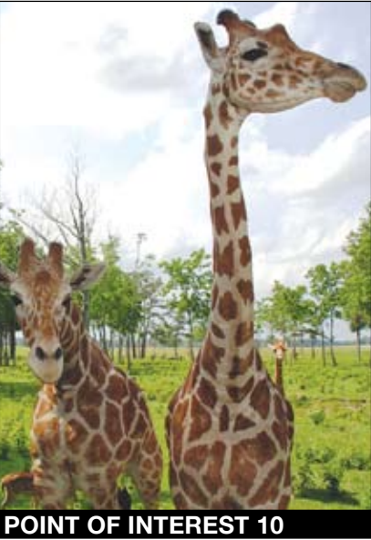
POINT OF INTEREST 10