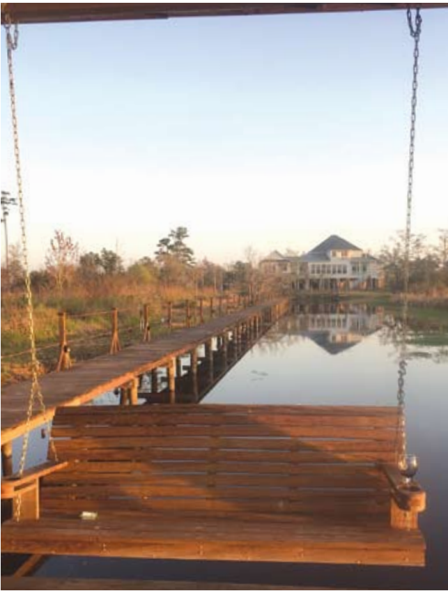
Bayou Haven, Slidell