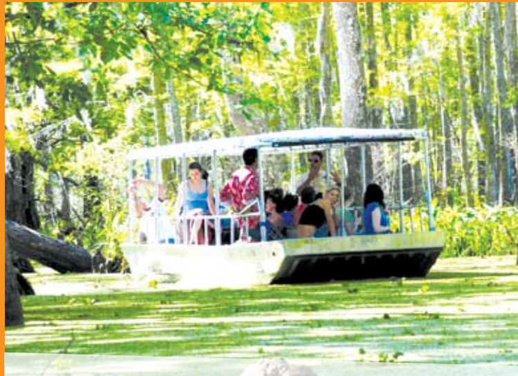
Several operators offer tours of the lovely and primeval Honey Island Swamp, where you'll see an abundance of wildlife, including gators, boar, and great blue herons.

► Located just northeast of Covington, Pontchartrain Vineyards produces fine table wines, with