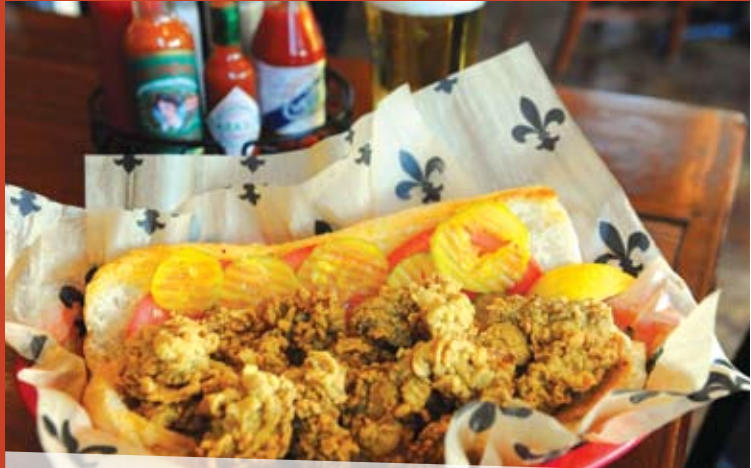
Grab a po-boy stuffed with perfectly fried oysters at Crabby Shack in Madisonville.

Country Kitchen Restaurant 2109 Florida St. (985) 626-5375 ► Omelets, traditional breakfasts, hot lunches and a buffet of home-style dishes.