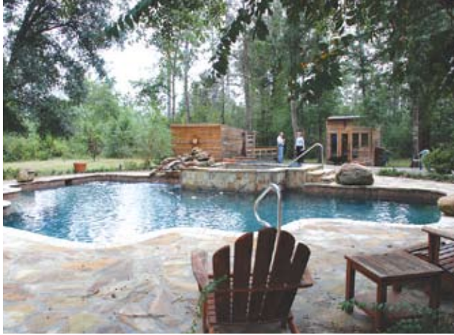
Abita Springs Be & Be, Abita Springs