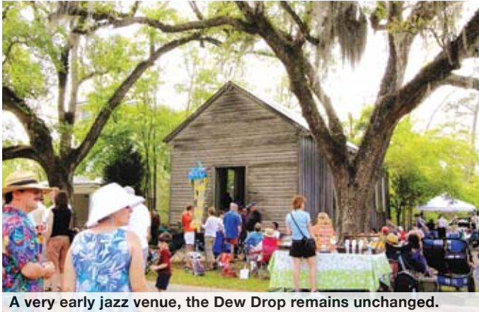
A very early jazz venue, the Dew Drop remains unchanged.

It's small as concert halls go. It's never had electricity. Or A/C. And yet the Dew Drop looms large for jazz pilgrims looking for the real thing. Area musicians say gigs there feel special, maybe even spiritual. And a devoted clutch of German jazz musicians makes a biannual journey just to play on the rustic stage of what is believed to be the world's oldest unaltered rural jazz hall. The Dew Drop Social and Benevolent Hall opened in what is now Old Mandeville in 1895 by a group of civic-minded African-American residents as a venue for raising funds for needy individuals in their community. Located in the 400 block of Lamarque, just blocks from the Mandeville lakefront, the unpainted wooden structure looks as it did more than a century ago when musicians playing a new type of music called jazz took steamboats across the lake from New Orleans to play at the hall. Among them were early greats Buddy Petit and Kid Ory; later a young Louis Armstrong played there. The Dew Drop is still hosting musicians, now brought in by Friends of the Dew Drop, who play for visitors sitting on wooden benches or outside (windows are thrown open so sound carries) on lawn chairs. Watch for concert dates on our online calendar of events at www.LouisianaNorthshore.com or visit www.DewDropJazzHall.com for more information.