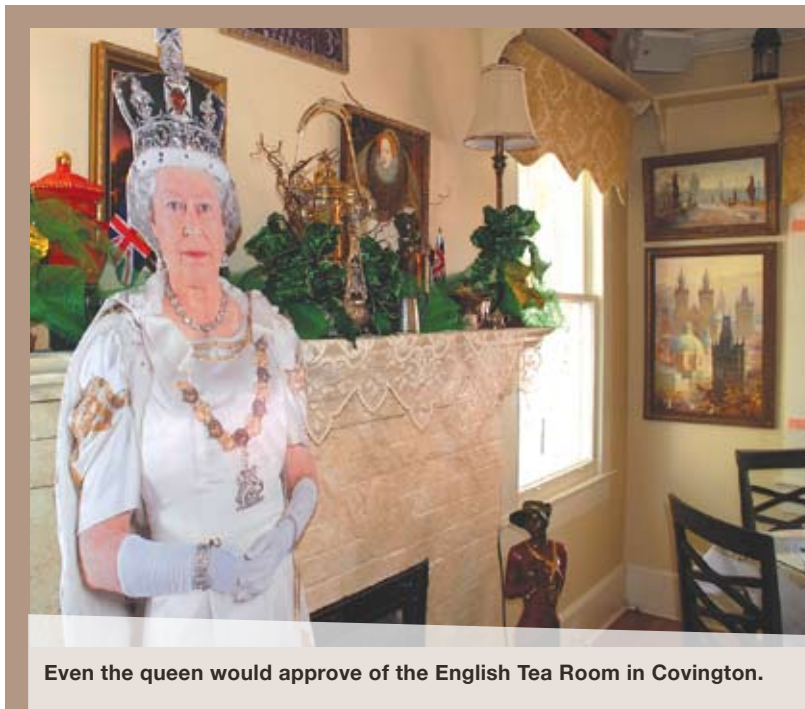
Even the queen would approve of the English Tea Room in Covington.