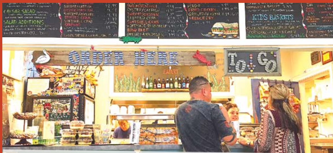
Belly up to the counter to order a host of Louisiana specialties at Mandeville Seafood Market & Eatery.