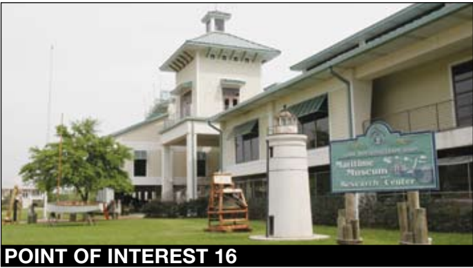
POINT OF INTEREST 16