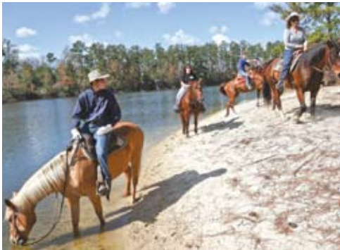
Splendor Farms, Bush

All four of these great spots joined the Northshore's B&B inventory in the past year, adding options to the area's array of sweet, just-what-you-need experiences. Prefer a cabin in the woods? A place that will cook you breakfast – or one that will leave you alone with your coffee and a lazy morning? Do you travel with your pet? Or your offspring? Want a crafts weekend with your best girlfriends? We've got you covered, friend, so welcome to the Northshore. CONTINUED ON PAGE 3