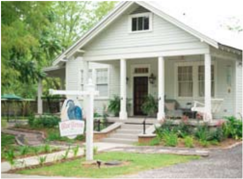
Blue Heron, Mandeville