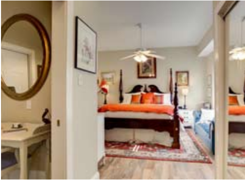
About Trace, Mandeville