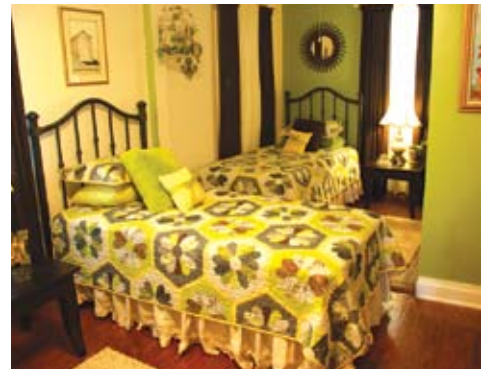
Pine Lily Retreat, Lacombe