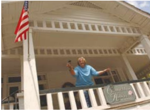
Camellia House, Covington