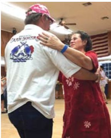
Cajun Dance lessons are taught monthly in Abita Springs.

Spring for Art ► Historic Downtown Covington (985) 892-8650 www.sttammanyartassociation.org Hours: 6-9pm