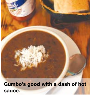
Gumbo's good with a dash of hot sauce.

Though gumbo has popped up on menus across the U.S., you're not likely to get the real thing outside of south Louisiana unless it's cooked by a transplanted native. A dark, flavorful soup, real gumbo takes a long time to cook and requires a little voodoo to do properly; most gumbos are variations on