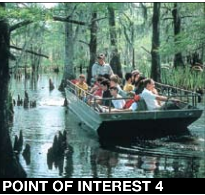
POINT OF INTEREST 4