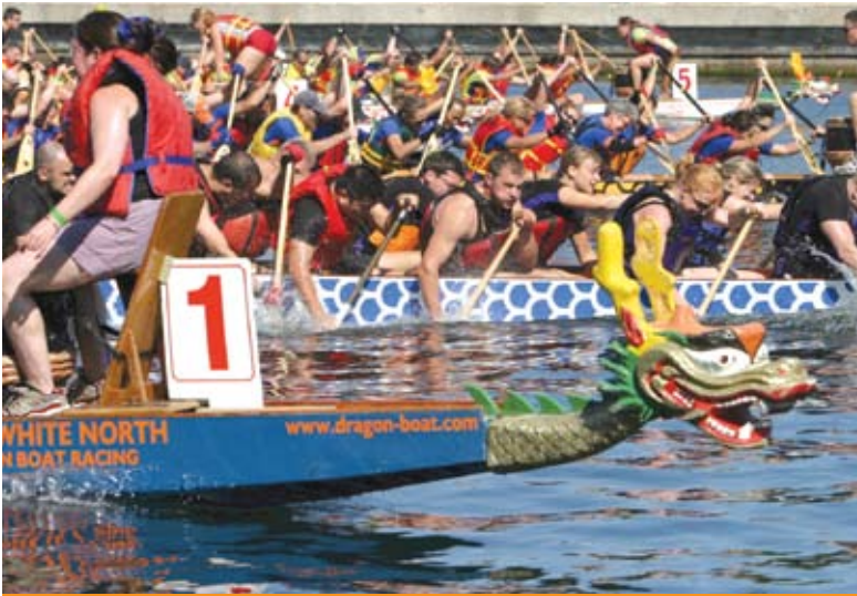
Paddlers and spectators will have a blast at the May 13 Dragon Boat Festival.