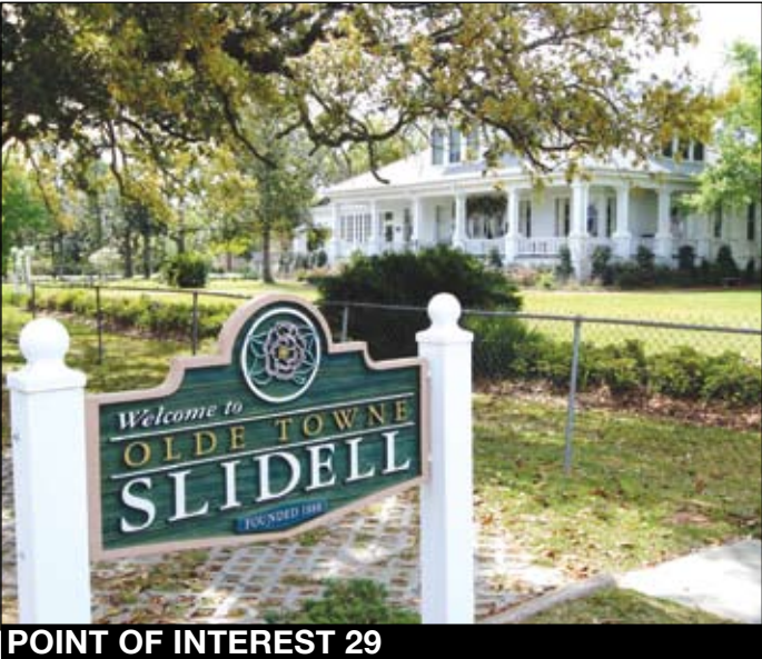
POINT OF INTEREST 29