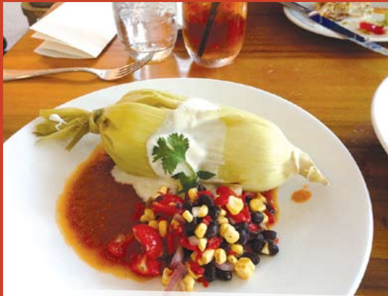
Chef Jeffrey Hansell's flavorful chicken tamale is a good start to a great meal at Oxlot 9 in Covington.