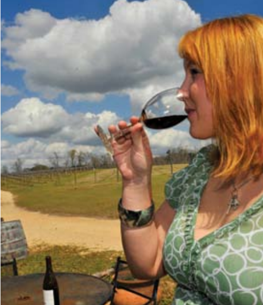
Sample award-winning wines at Pontchartrain Vineyards.

Come. There's a place at the table waiting for you.