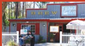
Grab a brew and a burger at Abita Brew Pub in Abita Springs.

Glory Bound Gyro Co. 500 River Highlands Blvd. #100 (985) 871-0711 www.gloryboundgyroco.com ► Variety of gyros and dips, plus shawarma, pastas, desserts and kids menu. Small grocery.