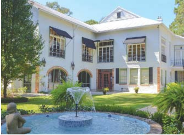
Annadele's Plantation, Covington