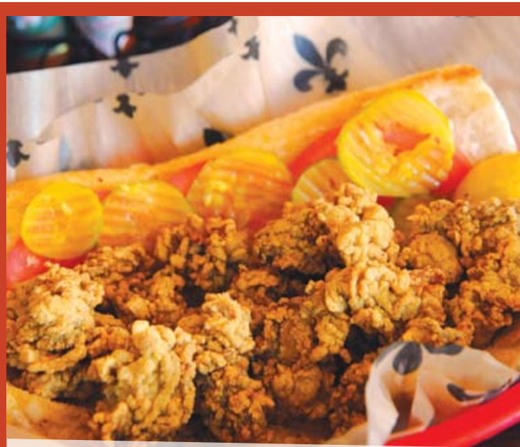
Fried oyster po-boys are just the start at Crabby Shack in Madisonville.

Boudreaux's Boudin and Cajun Meats 4628 Hwy. 22 (985) 845-5001 www.boudreauxcajunmeats.com ► Louisiana specialties at this family-owned shop, including boudin, cracklins, Turduckens, smoked meats and seafood.