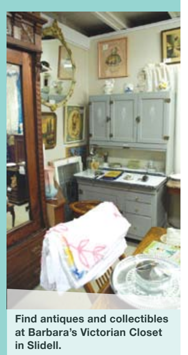
Find antiques and collectibles at Barbara's Victorian Closet in Slidell.

► Thousands of bead varieties. Unique gift items, works by local artists.