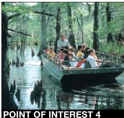
POINT OF INTEREST 4