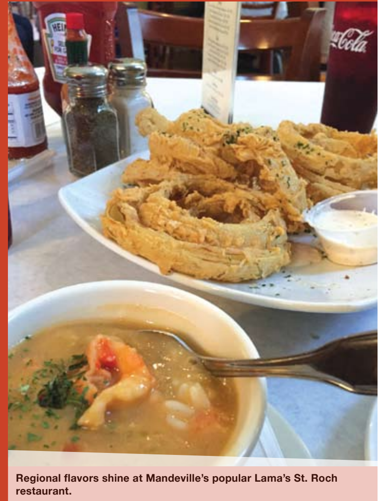
Regional flavors shine at Mandeville's popular Lama's St. Roch restaurant.

600 N. Causeway Approach (985) 626-4476 www.treyyuen.com ► Culinary creations from the Wong brothers combine local seafood with Chinese seasoning and technique. Lovely pagoda setting. Full bar.