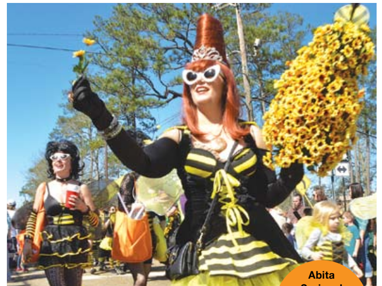
Abita Springs' popular Push-Mow Parade is Feb. 3.

Founded in 1965, this 300-member Krewe is the oldest in St. Tammany. Members ride 19 floats, trucks and horses interspersed with marching bands from across the Northshore. Features with lighted throws, Tulane University Marching Band, Disco Amigos, Laissez Boys and Budweiser Clydesdales. Starts in front of St. Tammany Parish Justice Center