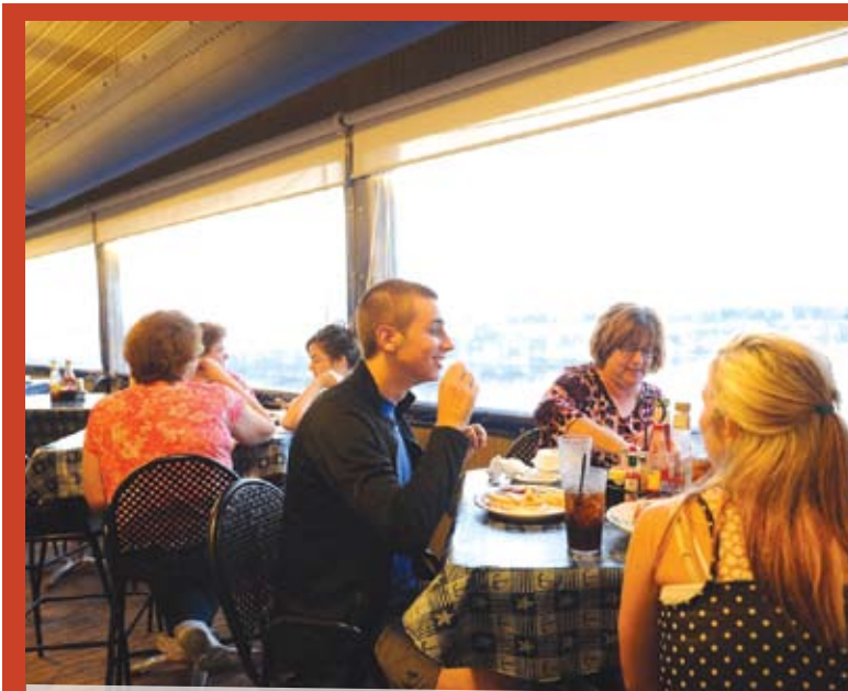
Enjoy great seafood with a view of the water at Phil's Marina Café.