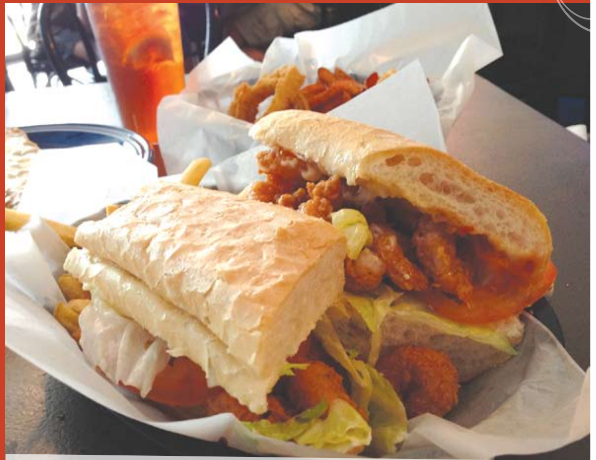
You'll find po-boy variations — stuffed with beef, seafood, anything delicious — all over the Northshore.

But the store's pralines are the headliner. Its kitchen turns out hundreds a day to meet the demand. The candy cases are the first thing you see when you come in and the last thing you see on the way out. Samples on the counter get everyone's attention. Nibbler, beware: One bite, and you're hooked. You're going to be taking some of these babies home.