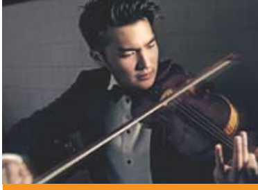
Violinist Ray Chen plays with the LPO Jan. 5 in Covington.