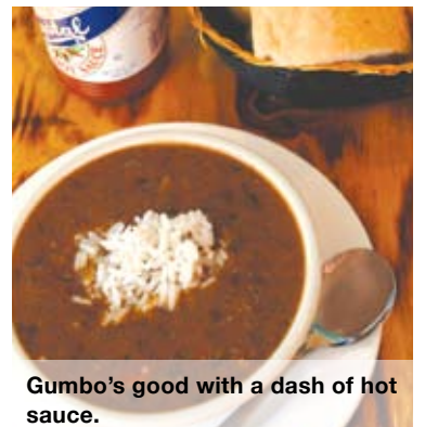
Gumbo's good with a dash of hot sauce.

Though gumbo has popped up on menus across the U.S., you're not likely to get the real thing outside of south Louisiana unless it's cooked by a transplanted native. A dark, flavorful soup, real gumbo takes a long time to cook and requires a little voodoo to do properly; most gumbos are variations on