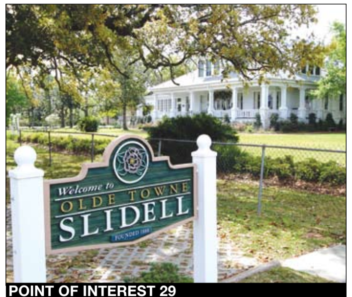
POINT OF INTEREST 29