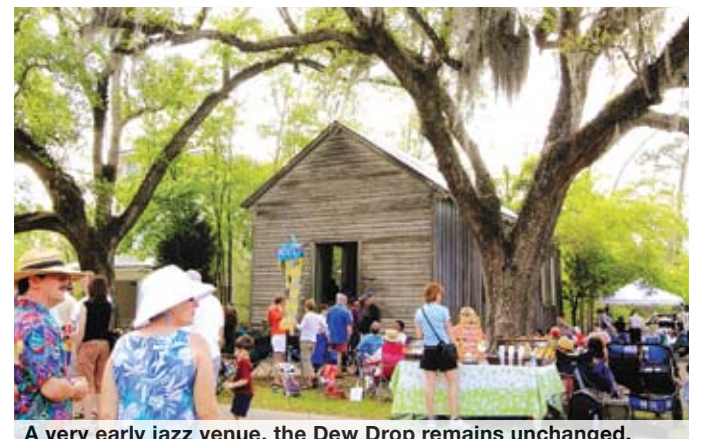
A very early jazz venue, the Dew Drop remains unchanged.

Watch for concert dates on our online calendar of events at www.LouisianaNorthshore.com or visit www.DewDropJazzHall.com for more information.