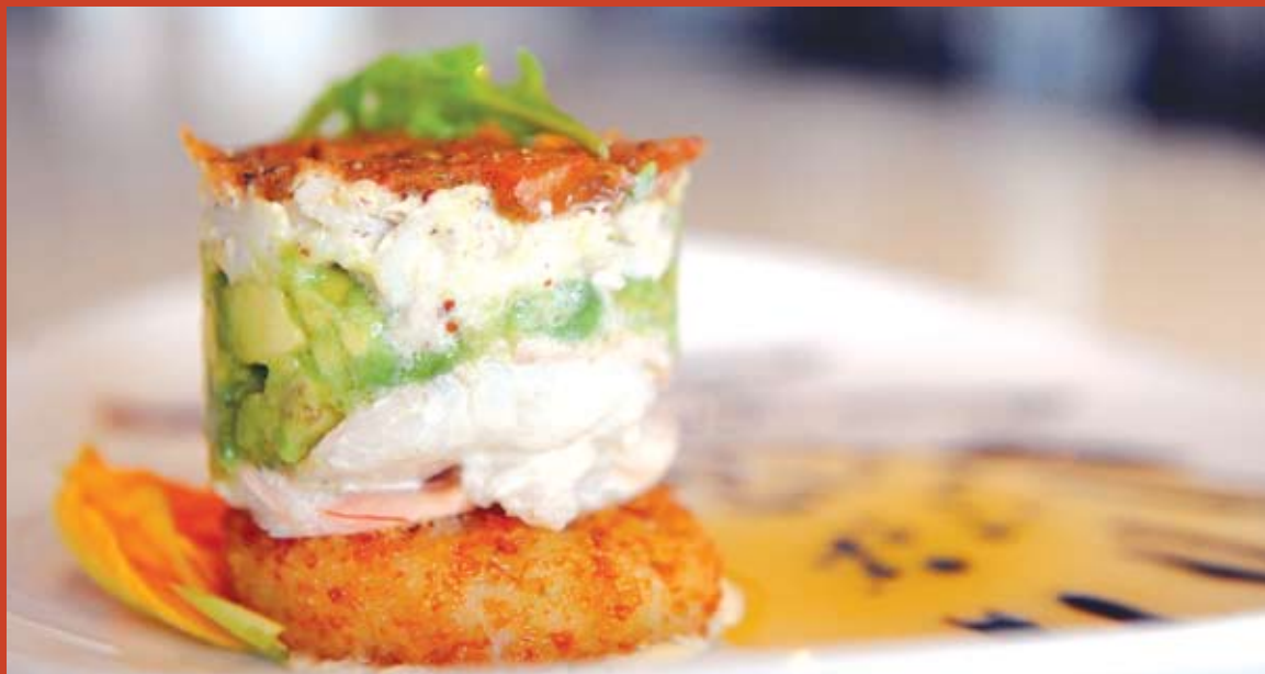
The food's pretty and pretty delicious at Pardo's.