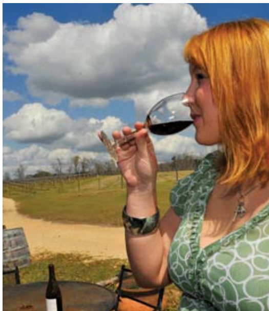
Sample award-winning wines at Pontchartrain Vineyards.

Come. There's a place at the table waiting for you.