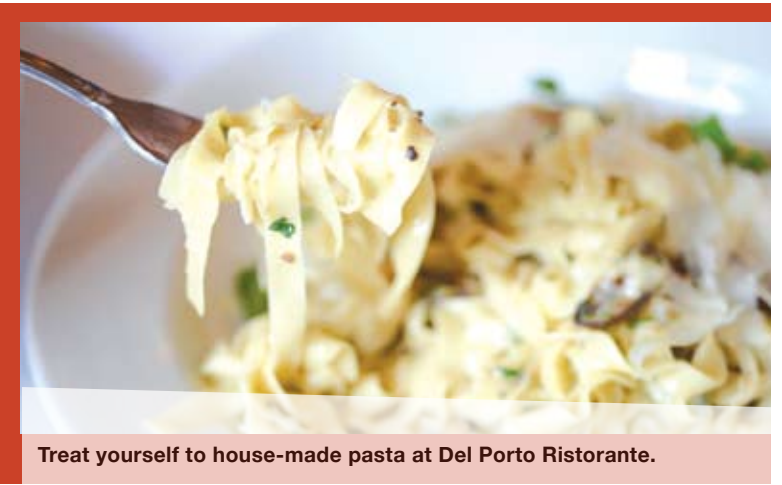
Treat yourself to house-made pasta at Del Porto Ristorante.

DiMartino's Muffulettas 700 S. Tyler (985) 276-6460 www.dimartinos.com ► Seafood and po-boy platters, gumbo, burgers and specialty sandwiches.