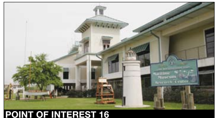
POINT OF INTEREST 16