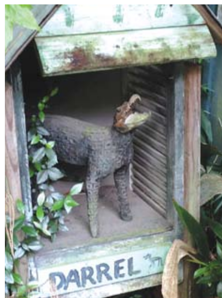
The mythical 'Dogigator' is among the eclectic creatures at Abita Mystery House.