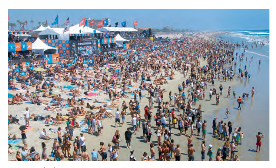
2011 US Open of Surfing

Conducted during the 2010 US Open of Surfing in partnership with the City of Huntington Beach, this economic impact study found that the US Open of Surfing generated an estimated $21.5 million in direct total spending, with $16.4 million spent in Huntington Beach and $6.3 million spent throughout Orange County. Direct taxable spending of $13.2 million in Huntington Beach generated an estimated $475,465 in local lodging and retail sales tax revenues. In addition, the study found when factoring an average of 2.67 days per person spent at the event, there were 185,000 unique attendees and a total attendance of an estimated 494,000.