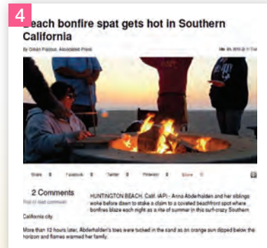
Campaign Clips Pictured Above by Number: 1 The New York Times published a bonfire article on the front page of its May 13, 2013 national edition; 2 CBS News and other Los Angeles based media covered a bonfire support rally hosted by Assemblyman Travis Allen on July 7, 2013; 3 The header image used for SaveTheBonfireRings.com, e-blasts, and printed fact sheets; 4 The Associated Press published an online story about the bonfires on May 4, 2013; the article was picked up by multiple news websites and shared around the globe.