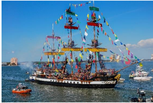
The pirate ship Jose Gasparilla leads the invasion