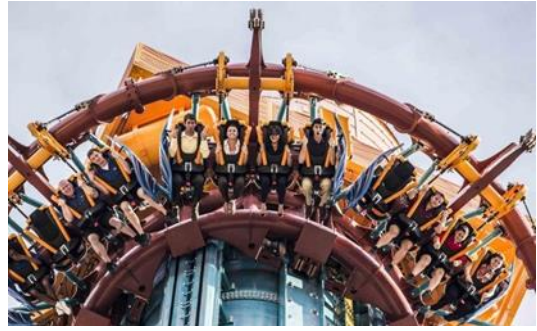
Falcon's Fury makes hearts pound with excitement

Busch Gardens Tampa offers 300 acres (121 hectares) of treasures to discover. An expansive wildlife park is home to zebras, gazelles, ostriches, and other African wildlife. Riders brave enough to board the NEW Falcon's Fury , a 335-foot-tall (102 meters) drop tower, plummet face-down like the ride's namesake. After the heart-pounding fun, quality dining and entertaining shows help visitors bring their pulse rates back to normal.