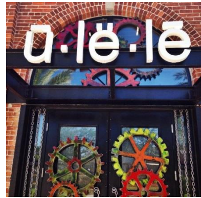
Ulele's menu is inspired by native foods

Traditional lives at Bern's Steak House , where the name says it all. The world's largest private wine cellar and decadent dessert room mean that Bern's may be traditional, but it's not ordinary.