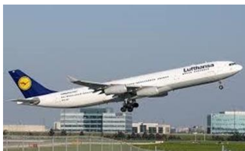
Lufthansa began flights to Tampa Bay Sept. 25