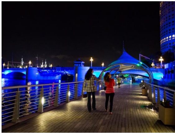
Tampa Riverwalk links attractions like gems on a string