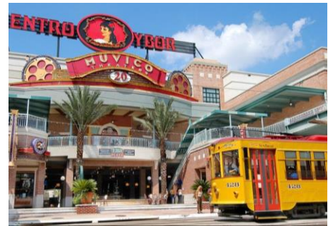
Historic streetcars carry visitors to Ybor City

Ybor City made Tampa Bay the Cigar Capital of the World for more than 50 years. Descendants of Cuban, Spanish, Italian, and German immigrants still make cigars by hand and smoke them while drinking café con leche before heading to a concert or dance club. The 110-year-old Columbia Restaurant is the oldest Spanish restaurant in Florida and an Ybor City icon, serving traditional Cuban and Spanish food, including paella while Flamenco dancers perform. A park honors 19th Century Cuban revolutionary José Martí. Get there on a historic streetcar.