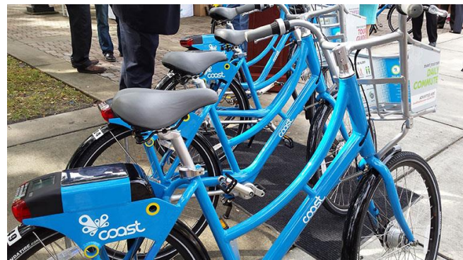
Coast Bike Share has stations through downtown, Ybor City

Explore downtown on two wheels by renting a from Tampa Bay's new bicycle vendor -- Coast Bike Share . Stations stand outside many of downtown's most popular sites. With a smartphone and a credit card, you can be registered and riding in a matter of minutes. Tampa Bay's network of bike trails will take you along our sparkling waterfront on the Tampa Riverwalk and Bayshore Boulevard as well as into the historic Ybor City entertainment district along the newly opened Selmon Greenway .