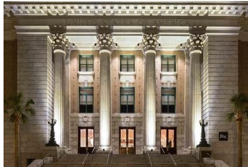
Le Méridien restored a piece of history