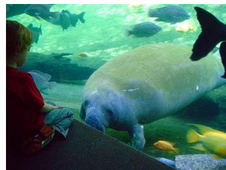
Meet a manatee at Tampa's Lowry Park Zoo

CityPASS costs $99 for adults, $84 for children 3-9 years of age -- a 49% saving.