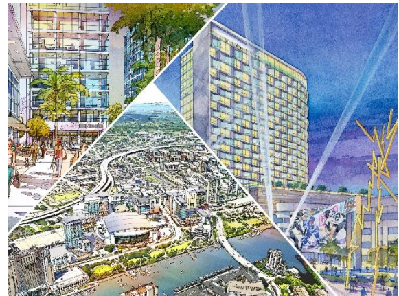
$1 billion in new projects will transform the Channelside

Coming soon to Tampa Bay's Channel District: $1 billion in new projects, including a medical school, shops, entertainment, and a new convention hotel. Jeff Vinik, owner of the Stanley Cup-winning Tampa Bay Lightning, and Microsoft founder Bill Gates have joined forces to reinvent the Channelside Bay Plaza entertainment complex and 40 acres of former industrial land on the east side of downtown. Work will begin this year. Vinik also plans improvements to Marriott Waterside Hotel & Marina.