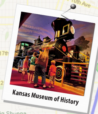
Kansas Museum of History