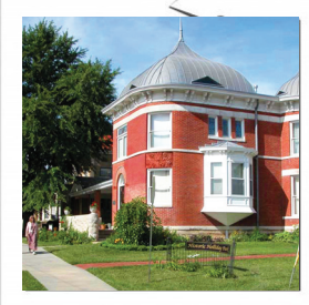
Charles Curtis Museum