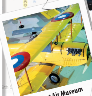
Combat Air Museum