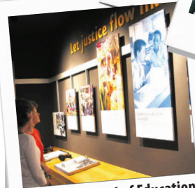
Brown v. Board of Education National Historic Site