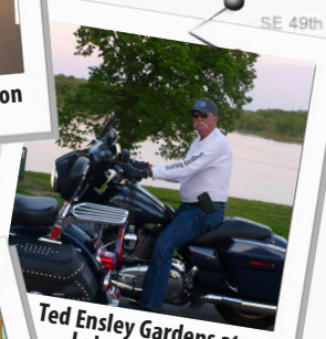
Ted Ensley Gardens at Lake Shawnee