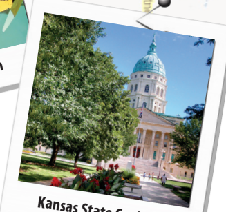
Kansas State Capitol