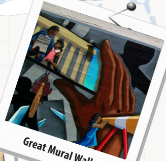
Great Mural Wall