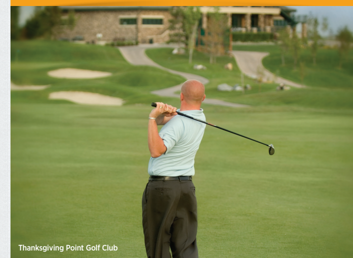
Thanksgiving Point Golf Club