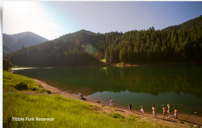
Tibble Fork Reservoir