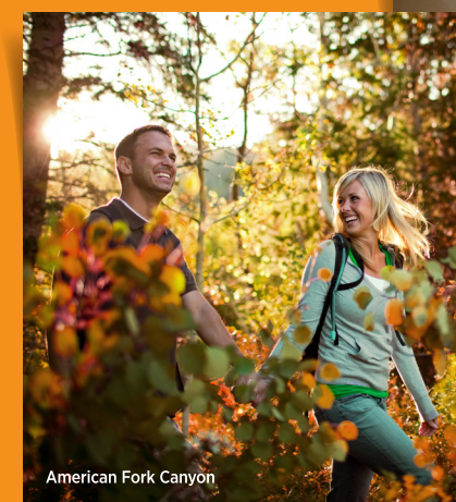
American Fork Canyon

Utah Valley consistently ranks among the top 20 places to live in the U.S., thanks to four beautiful and distinct seasons, a rich and diverse history, breathtaking scenery and a variety of enjoyable activities and events. Utah Valley is not just a great place to live — it's also a popular gathering place for families, friends and businesspeople alike. It's a one-of-a-kind destination.