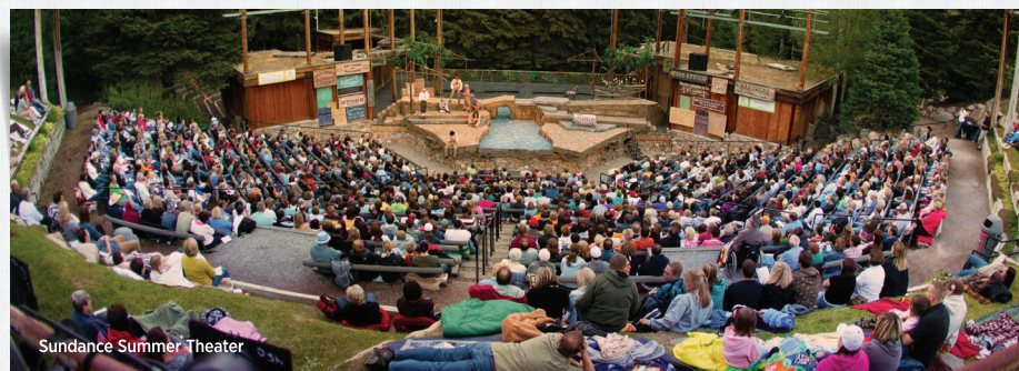
Sundance Summer Theater