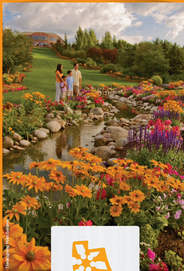
Thanksgiving Point Gardens