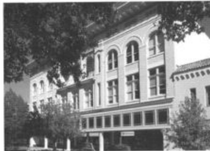
The Taylor Bros. Department Store building was originally built in 1890, and expanded in 1902 and 1911.