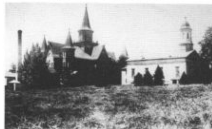
The 1885 tabernacle with central spire, left; the 1867 tabernacle, right. View from Center Street looking southeast.

area. The pioneers began the foundation of a tabernacle on this block, based on drawings provided by Truman Angell, the LDS Church architect who also designed the Salt Lake Temple. Before much work had been completed, however, Brigham Young visited the area in 1852 and suggested moving the site of the tabernacle about two miles east, to where Provo's current tabernacle park is, at the intersection of University and Center Streets. This site was on the outskirts of what had become a fairly substantial town, and it began a controversy among many of the area's residents who were used to the Mormon custom of having their most important public buildings in the city's center.