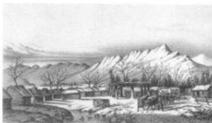
The 1849 fort built by Provo pioneers was located near where Interstate 15 crosses the Provo River today.

Brigham Young, the great Mormon colonizer, first visited the Provo area on