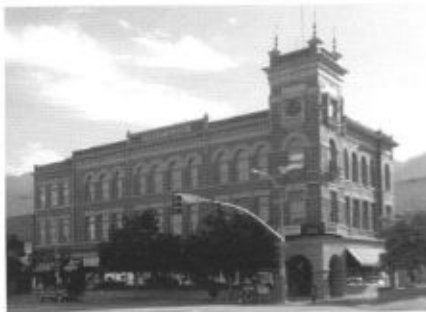
The Knight Block Building, 1 East Center Street, was built in 1900 as an office for Jesse Knight's mining and business ventures.

became too small for the amount of use it was receiving, a new tabernacle, which still stands, was completed and dedicated in 1885. Provo's development between 1890 and 1915, when many of the structures included in this self-guided tour were constructed, was influenced by a competition between the city's east and west sides that occurred as a result of the tabernacle's relocation. By 1896, Jesse Knight had become wealthy due to his mining ventures in the Eureka area. He moved to Provo and began advocating the development of the east side, where the new tabernacle was located. He not only built his own home and the homes of his family members on the east side, but he worked to bring the city's most impressive commercial structures, such as the Knight Block Building, to the area.