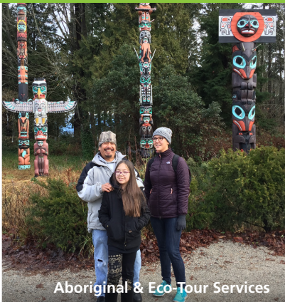
Aboriginal & Eco-Tour Services