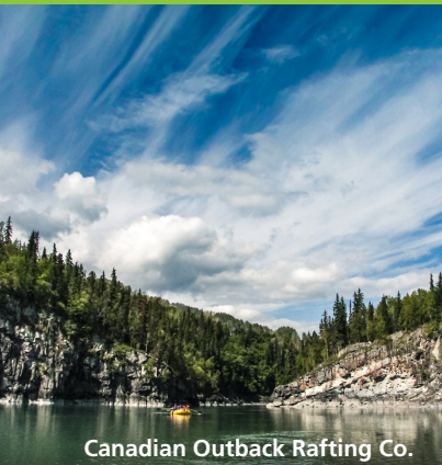
Canadian Outback Rafting Co.