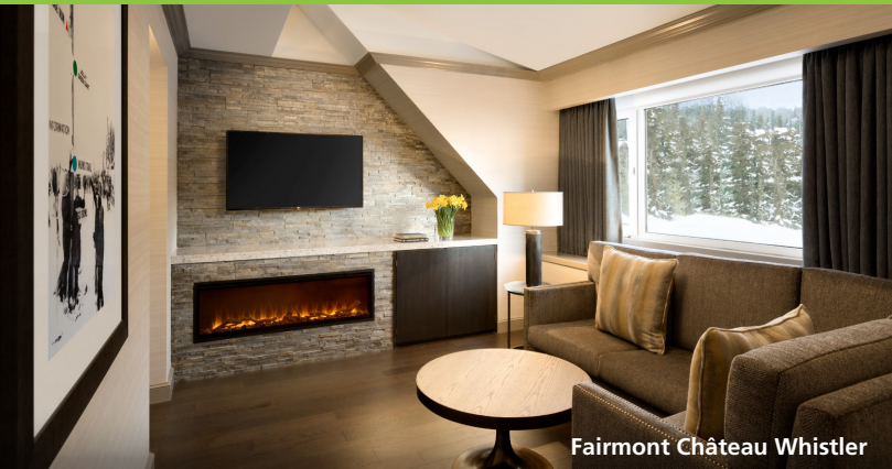
Fairmont Château Whistler