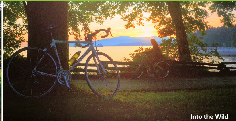
Into the Wild