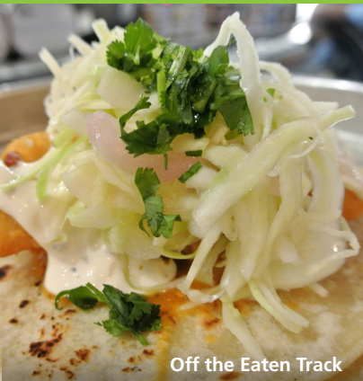
Off the Eaten Track