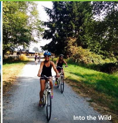
Into the Wild