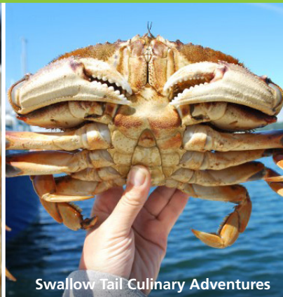
Swallow Tail Culinary Adventures