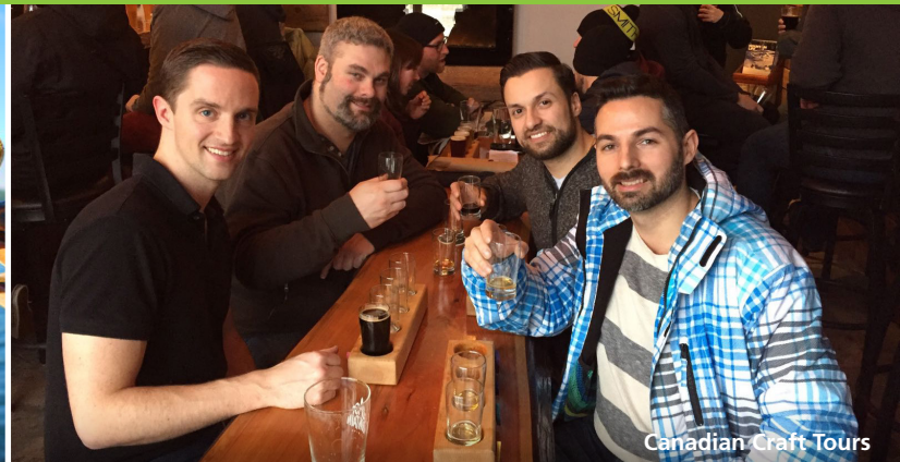
Canadian Craft Tours