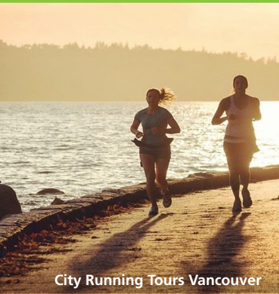
City Running Tours Vancouver