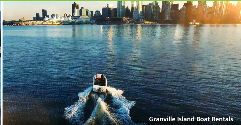
Granville Island Boat Rentals