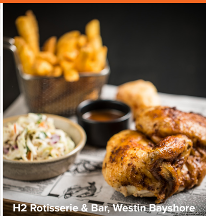
H2 Rotisserie & Bar, Westin Bayshore