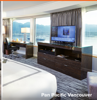
Pan Pacific Vancouver