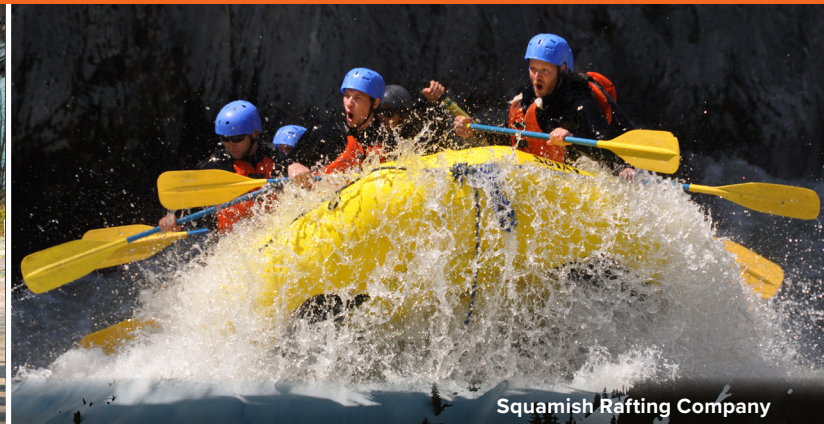
Squamish Rafting Company