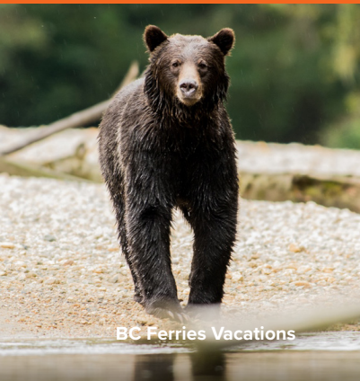
BC Ferries Vacations