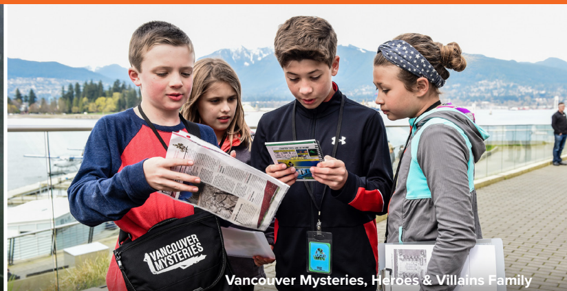
Vancouver Mysteries, Heroes & Villains Family