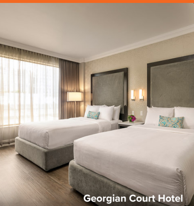
Georgian Court Hotel