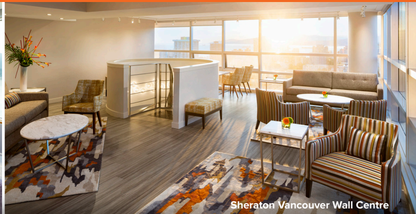
Sheraton Vancouver Wall Centre