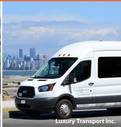
Luxury Transport Inc.