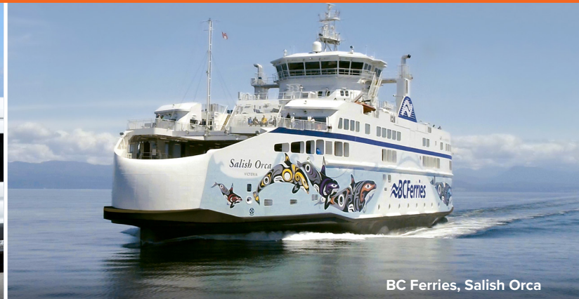
BC Ferries, Salish Orca