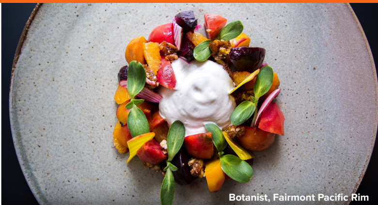
Botanist, Fairmont Pacific Rim