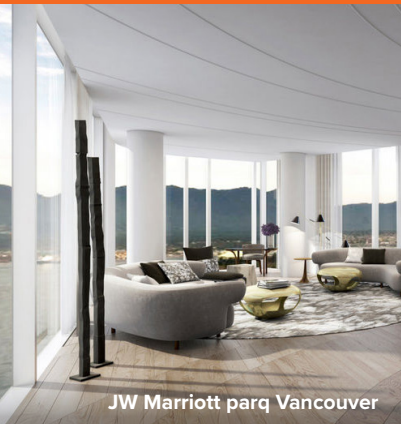
JW Marriott parq Vancouver