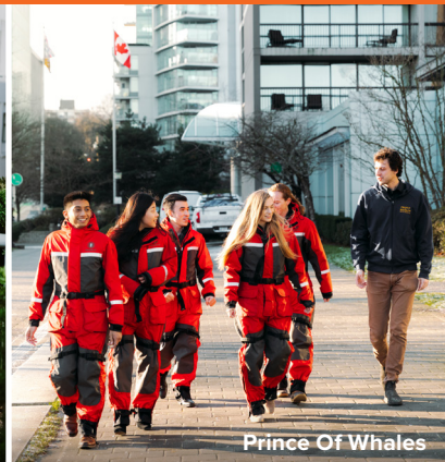
Prince Of Whales