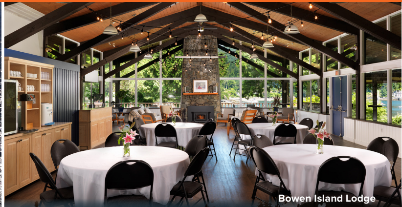
Bowen Island Lodge