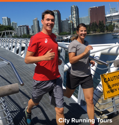
City Running Tours