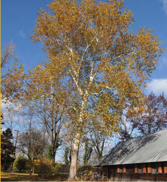
A ginkgo tree planted in 1785 in Bartram's Garden