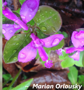
~ Marian Orlousky

Sugar maples, water fowl and historic charm make Children's Lake in Boiling Springs (40.14982, -77.12695) one of the most picturesque towns through which the Trail wanders.