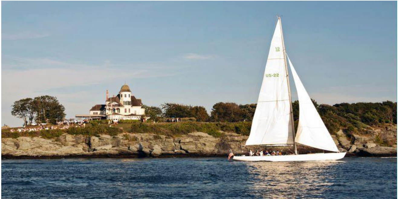
Castle Hill Inn

One of the prettiest views in all of Newport can be found at the Castle Hill Inn . Sit on the outdoor deck of its water-facing restaurant — or better yet, sit in one of the white Adirondack chairs on the manicured lawn, just steps from a historic lighthouse, and gaze at the sailboats and yachts gliding by, mimosa in hand.