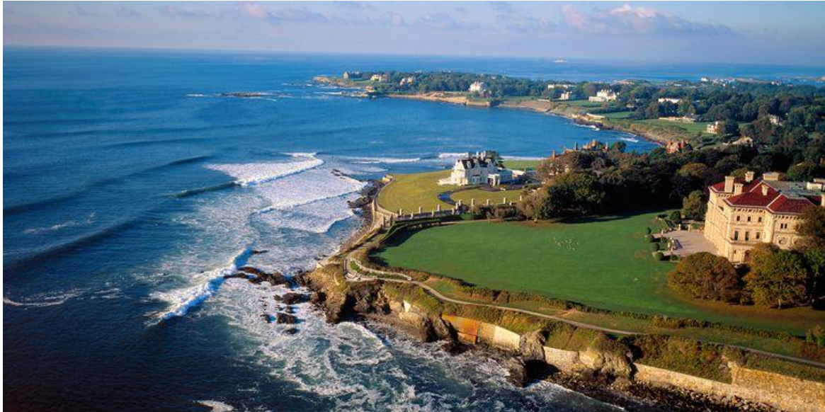
Onne van der Wal

One of the top things to do in Newport is Cliff Walk , a scenic 3.5 mile coastal path. The trail can be challenging at times, as the surface changes from flat pavement to uneven rocks, so wear proper footwear, but be prepared to be blown away by the views of the Atlantic Ocean on one side and grand mansions on the other.